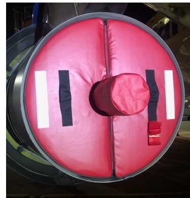
Airbus A320 Exhaust Plug/Nozzle Cover