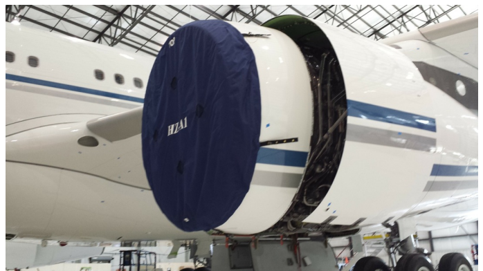
Airbus 340 Intake Covers