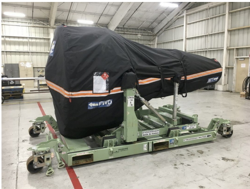
CFM56-5B Off Link Cover, fully enclosed

ALL-YEAR USE MATERIAL - Made with Solution dyed Polyester fabric, the all-year use material is the best option for sun protection and cover longevity. This heavier more durable material is intended for all weather conditions, such as rain and snow or lots of sun.