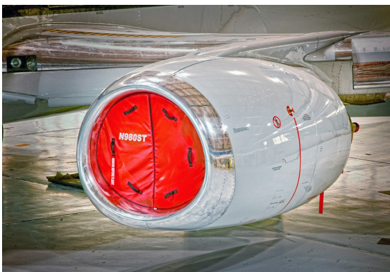
Boeing 737 Next Gen Engine Intake Plug, Folding Type

The Engine Inlet Plugs are custom fit for your Airbus A320 intakes, made with heavy-duty vinyl material, and stuffed with a single block of sculpted urethane foam. Each plug has a zipper that allows the foam to be removed and dried if necessary. Engine plugs have 'remove before flight' streamers sewn onto the face of the plugs. Most plugs are imprinted with the aircraft registration number in black for an extra charge. Storage bag NOT included. Engine plugs may be inserted after flight when the engine is still warm. Engine Inlet Plugs are commonly referred to as Cowl Plugs, Intake Plugs, Cowl Blocks, Engine Blocks, and Engine Bungs.