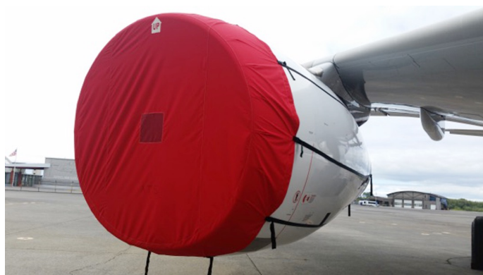
Airbus A330 Intake Cover, Trent 700 Engine