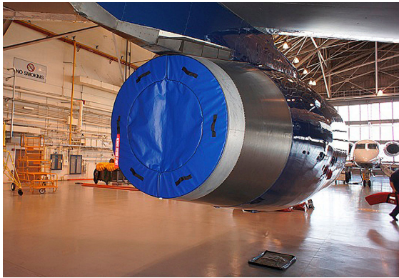
Boeing 757 Exhaust Plugs

The Engine Exhaust Plugs are custom fit for your Airbus A330, A350 exhaust openings, made with heavy-duty vinyl material, and stuffed with a single block of sculpted urethane foam. Each plug has a zipper that allows the foam to be removed and dried if necessary. Exhaust plugs have 'remove before flight' streamers sewn onto the face of the plugs. Most plugs are imprinted with the aircraft registration number in black for an extra charge. Exhaust plugs may be inserted soon after flight when the engine is still warm. Engine Inlet Plugs are commonly referred to as Cowl Plugs, Intake Plugs, Cowl Blocks, Engine Blocks, and Engine Bungs.