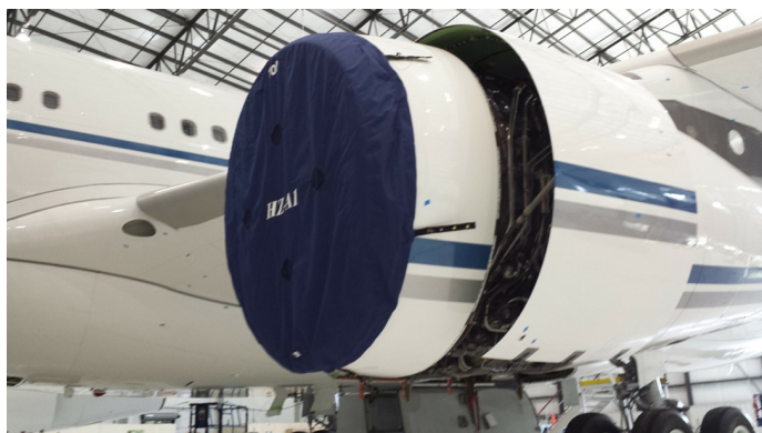
Airbus 340 Intake Covers