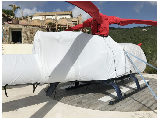
Aerospatiale Gazelle AS341 Bubble, Rotor Mast, Blade, Engine & Tailboom Covers (some are test fit covers)