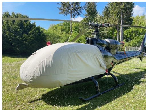
Aerospatiale Gazelle Bubble Cover