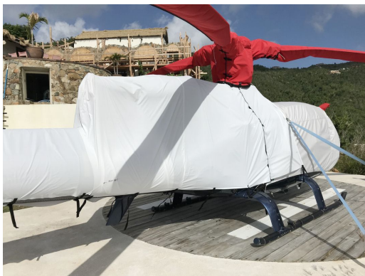
Aerospatiale Gazelle AS341 Bubble, Rotor Mast, Blade, Engine & Tailboom Covers (some are test fit covers)