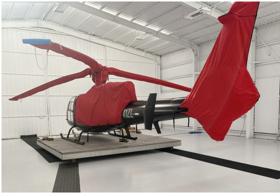
Aerospatiale Gazelle Engine, Rotor Hub, Blades & Tailfan Covers