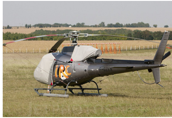
Airbus Helicopter AS350 Bubble Cover & Intake/Exhaust Cover