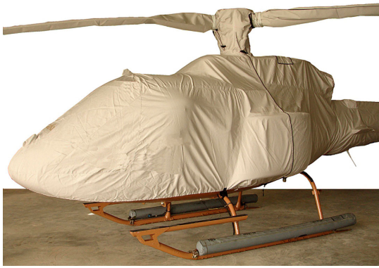
AS350 Main Body, Rotor Head, Blades and Tailboom Covers