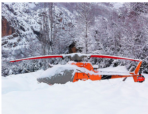
AS350 Bubble Cover, Insulated Main & Tail Rotor Covers, Blade Covers with tid-down detail