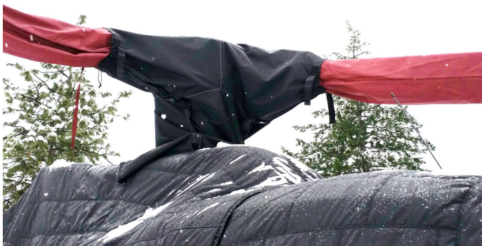
Main Rotor Hub Cover with swash plate extension.

WINTER USE MATERIAL - Made with Solution-Dyed Polyester fabric, this option is intended for seasonal use to aid in deicing, rain mitigation, or for occasional travel. The material is lighter and more compact, but more susceptible to UV damage and may have a shorter useful life if used continuously outside than the all-year use material.