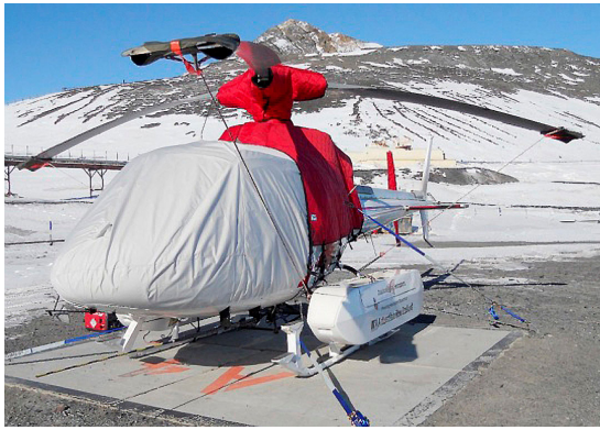
AS350 Bubble Cover w/ Cargo Mirror, Blade Tie-downs, Insulated Engine, Insulated Main Rotor Hub and Insulated Tail Rotor Covers