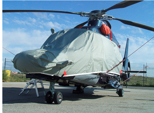
Dauphin Bubble Cover, extended nose