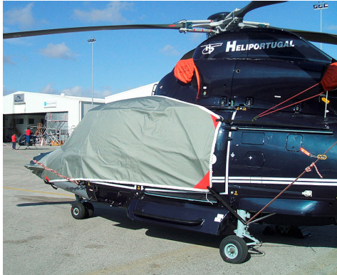
Dauphin Bubble Cover, extended nose

This cover type is made from Silver Acrylic Sunbrella canvas and is 100% lined with a soft and smooth microfiber. Bruce's Custom Covers developed this material combination especially for aircraft protection. The outer material is medium weight and treated for water resistance, UV resistance and anti-static buildup. The inner lining is a very soft and smooth microfiber to prevent scratching. The material is very reflective, and tests show that the cabin interior temperature can be reduced to near-ambient temperature on the hottest of days. It is water, ice and snow repellent, yet breathable to allow moisture to escape from between the cover and the aircraft surface.