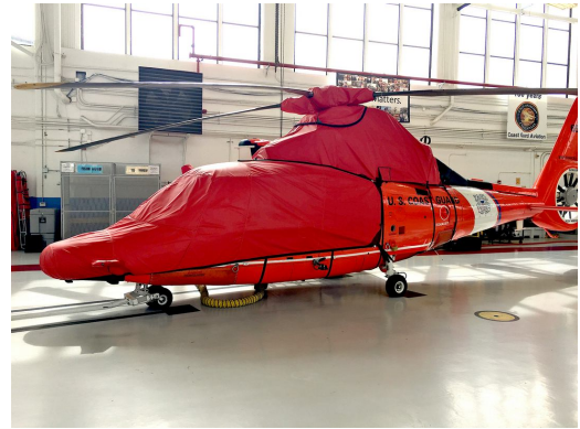
U.S. Coast Guard HH-65 Dolphin Bubble, Engine & Rotor Mast Covers