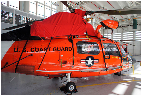
MH-65C Engine Area, Rotor Hub, Swash Plate Aperture Cover set, P/N: A365-210

Insulated Covers Material - A special composite material of solution-dyed polyester, 3M Thinsulate insulation, and soft nylon interior fabric. Our insulated covers are designed to complement an engine preheater and help retain heat in the engine compartment after shutdown. If you operate your aircraft in cold-weather, these covers will help prevent engine wear and tear.