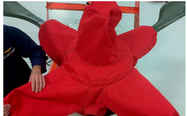
MH-65C Rotor Hub Cover w/ OADS Tube Cover detail