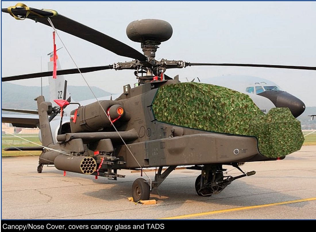
Canopy/Nose Cover, covers canopy glass and TADS