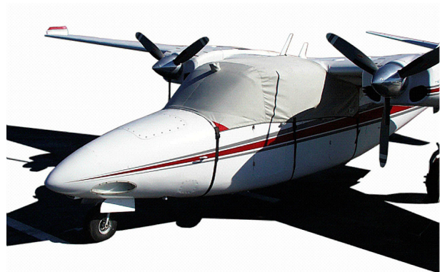
Aero Commander 680 Canopy Cover