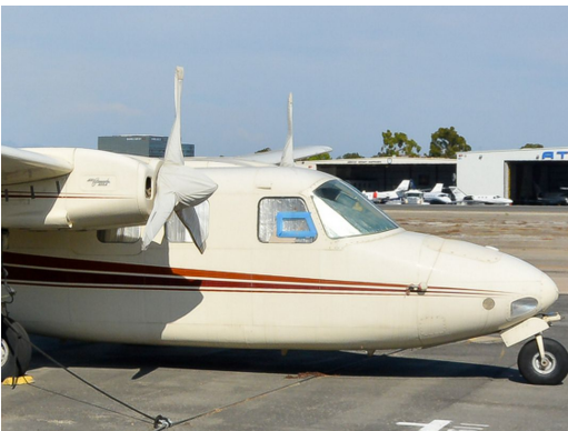
Aero Commander AC500 Ptopellor/Spinner Covers

This cover type is made from Silver Acrylic Sunbrella canvas and is 100% lined with a soft and smooth microfiber. Bruce's Custom Covers developed this material combination especially for aircraft protection. The outer material is medium weight and treated for water resistance, UV resistance and anti-static buildup. The inner lining is a very soft and smooth microfiber to prevent scratching. The material is very reflective, and tests show that the cabin interior temperature can be reduced to near-ambient temperature on the hottest of days. It is water, ice and snow repellent, yet breathable to allow moisture to escape from between the cover and the aircraft surface.