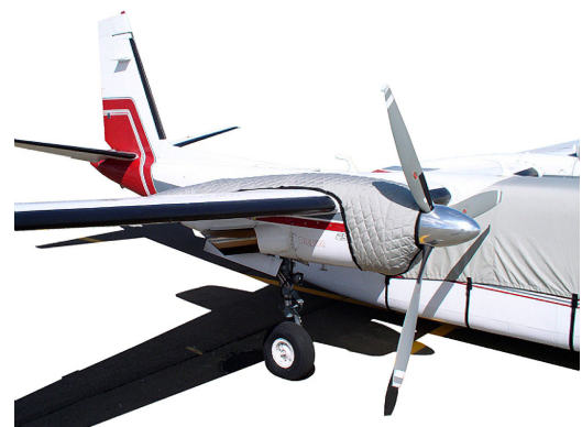
Aero Commander Insulated Engine Cover