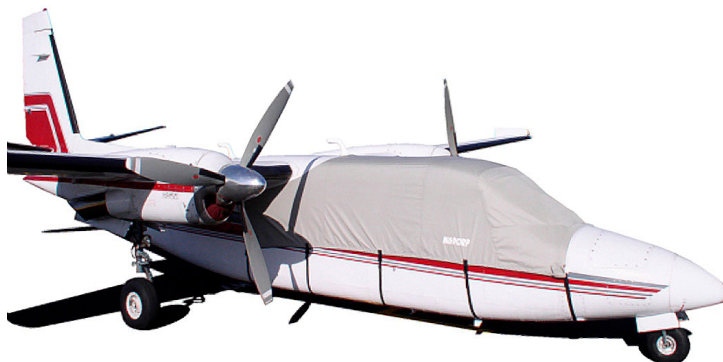
Aero Commander 690b Canopy Cover