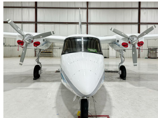
Aero Commander 500B Engine Intake Plugs