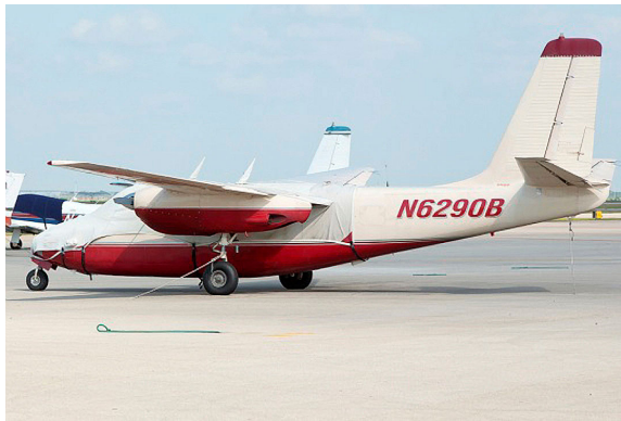
Aero Commander 500 Canopy/Nose Cover, Over-Top Type

This cover type is made from Silver Acrylic Sunbrella canvas and is 100% lined with a soft and smooth microfiber. Bruce's Custom Covers developed this material combination especially for aircraft protection. The outer material is medium weight and treated for water resistance, UV resistance and anti-static buildup. The inner lining is a very soft and smooth microfiber to prevent scratching. The material is very reflective, and tests show that the cabin interior temperature can be reduced to near-ambient temperature on the hottest of days. It is water, ice and snow repellent, yet breathable to allow moisture to escape from between the cover and the aircraft surface.