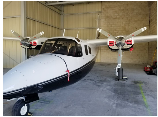
Aero Commander 500-A Pitot Covers