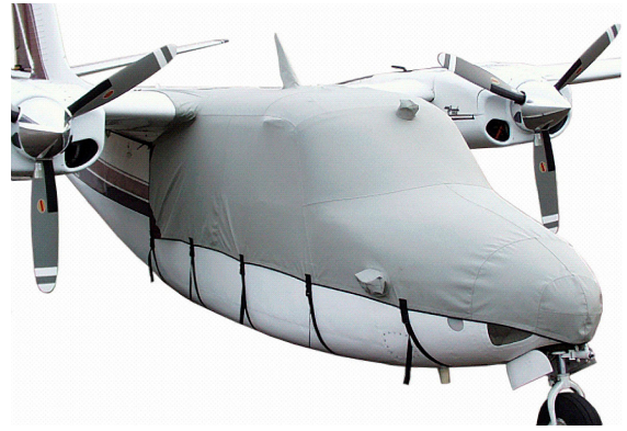
Canopy/Nose Cover (extends over top past leading edge)