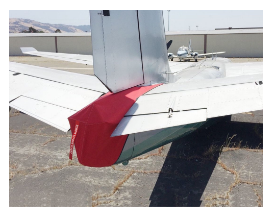
Rockwell Aero Commander Tailcone Cover

WINTER USE MATERIAL - Made with Solution-Dyed Polyester fabric, this option is intended for seasonal use to aid in deicing, rain mitigation, or for occasional travel. The material is lighter and more compact, but more susceptible to UV damage and may have a shorter useful life if used continuously outside than the all-year use material.