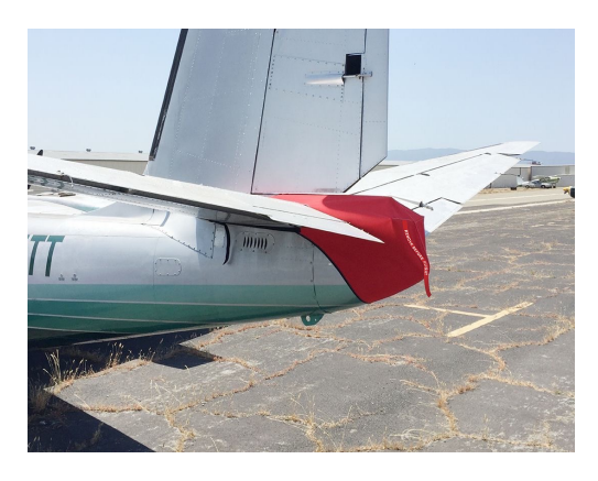
Rockwell Aero Commander Tailcone Cover