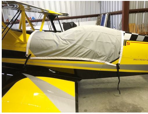
Acro Sport Acro II, Acroduster Travel Cover, Light Weight Travel Canopy Cover