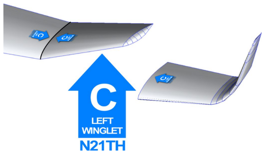
Sailplane Full Cover Set Graphic Indicators (Discus 2B, 3D model)