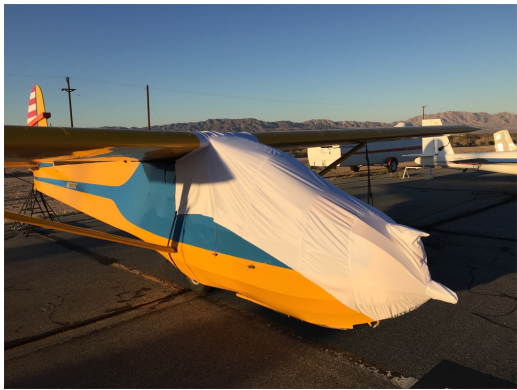
Schweizer SGU 2-22EK Canopy/Nose Cover, test fit cover

the hottest of days. It is water, ice and snow repellent, yet breathable to allow moisture to escape from between the cover and the aircraft surface.