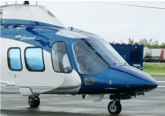
Agusta Grand Cabin & Skylight HeatShields