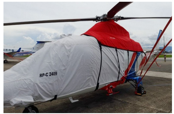
Agusta Grand AW109 SP Bubble & Engine Covers