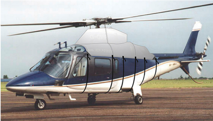
Agusta Power Engine Cover (illustration)