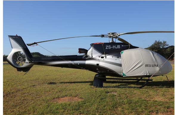
EC-130 Bubble Cover