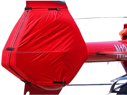
Eurocopter EC-120 Tailfan Cover

The Tailboom Cover details vary by model, but generally the helicopter tail boom cover encloses the tail boom from the "bottleneck" to the aft end. They usually also cover the horizontal stabilizers, and are custom made to allow for antennae, lights, and other protrusions. They attach with straps underneath the tail boom. Covers for the vertical and horizontal stabilizers are also available separately. Specific information for each model is available on request.