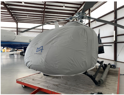
Airbus H-130 Bubble Cover, Travel Weight