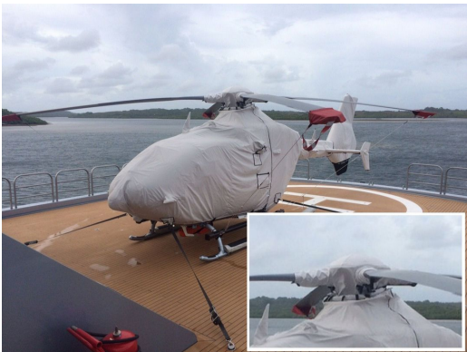
Airbus Helicopter AH135 Main Rotor Hub Cover