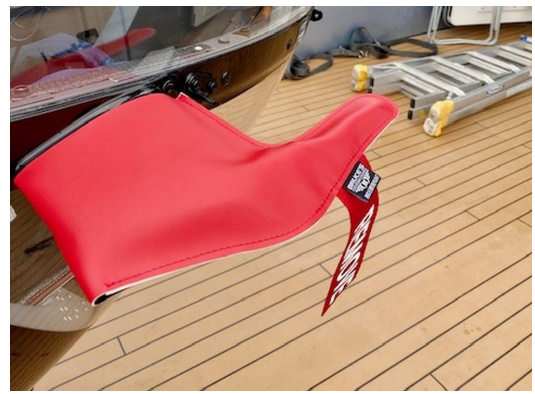
Airbus Helicopter H145 Pitot Tube Cover