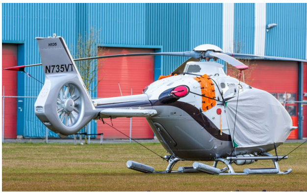
Airbus EC135T3 Blade Tie-Downs