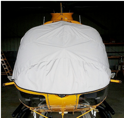
EC-135 Windshield/Skylights Cover, pinches in door jambs