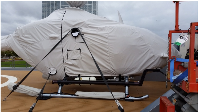
EC-135 Full Cover Set