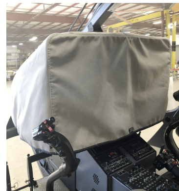
Eurocopter EC-135 Instrument Panel Heatshield Cover