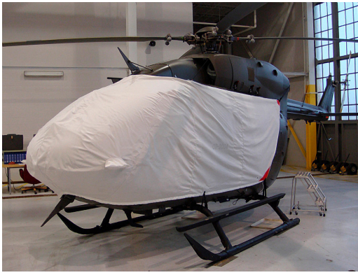
EC-145 Bubble Cover