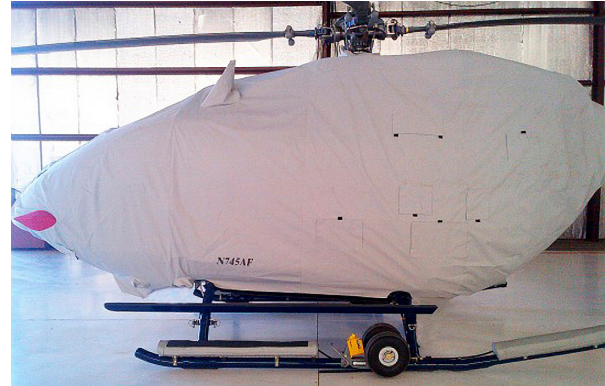
EC-135 Windshield/Skylights Cover, pinches in door jambs Eurocopter EC-145 Main Body Cover, also covers the bottom belly