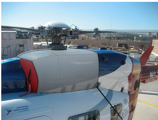
Upper Deck Plugs/Cover

The Engine Inlet Plugs are custom fit for your Airbus Helicopter H145, UH-145, BK-117 D-2, D-3 intakes, made with heavy-duty vinyl material, and stuffed with a single block of sculpted urethane foam. Each plug has a zipper that allows the foam to be removed and dried if necessary. Engine plugs have 'Remove Before Flight' streamers sewn onto the face of the plugs. Most plugs are imprinted with the aircraft registration number in black for an extra charge. Storage bag NOT included. Engine plugs may be inserted after flight when the engine is still warm. Engine Inlet Plugs are commonly referred to as Cowl Plugs, Intake Plugs, Cowl Blocks, Engine Blocks, and Engine Bunges.