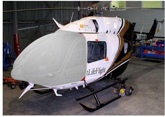
EC-145 Windshield/Nose Cover (illustration)