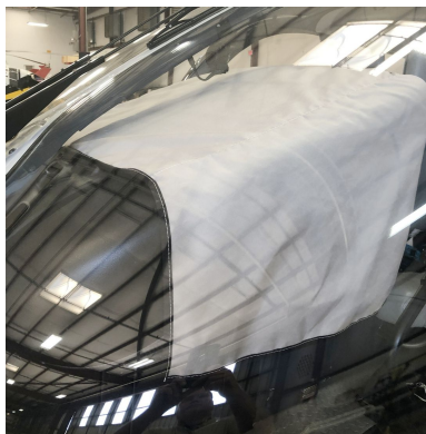
Eurocopter EC-135 Instrument Panel Heatshield Cover

Heatshields are interior sunshades for an aircraft's windows or canopy glass. The product is a unique composite of closed-cell foam with a silver mylar finish. The semi-rigid design is stiff enough to stand along the inside of the windshield using sun visors or window framing. It folds up flat and easily stores in the included storage sleeve. Some designs may require velcro and suction cups. A Heatshield is an excellent short-term remedy for cockpit overheating.