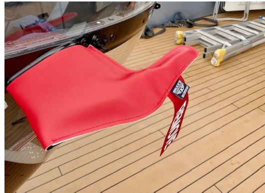
Airbus Helicopter H145 Pitot Tube Cover