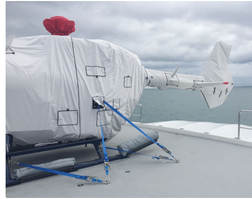
Eurocopter EC-145 D2 Main Body Cover, Tailboom/Fenestron Cover