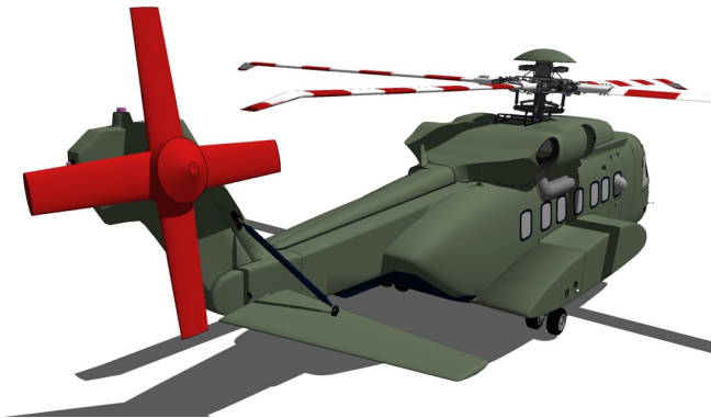
Sikorsky S-92 Tail Rotor Blade and Hub Covers

WINTER USE MATERIAL - Made with Solution-Dyed Polyester fabric, this option is intended for seasonal use to aid in deicing, rain mitigation, or for occasional travel. The material is lighter and more compact, but more susceptible to UV damage and may have a shorter useful life if used continuously outside than the all-year use material.