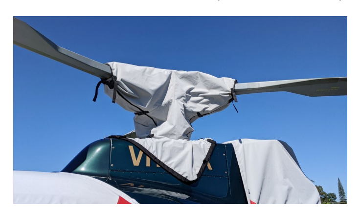
AS350 Main Rotor & Intake Covers

WINTER USE MATERIAL - Made with Solution-Dyed Polyester fabric, this option is intended for seasonal use to aid in deicing, rain mitigation, or for occasional travel. The material is lighter and more compact, but more susceptible to UV damage and may have a shorter useful life if used continuously outside than the all-year use material.