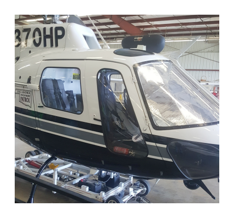
Aerospatiale AS350 Astar, Ecureuil, Esquilo, Fennec Windshield Heatshields