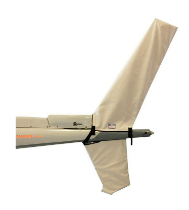
AS350B3 Vertical Stabilizers cover

The Tailboom Cover details vary by model, but generally the helicopter tail boom cover encloses the tail boom from the "bottleneck" to the aft end. They usually also cover the horizontal stabilizers, and are custom made to allow for antennae, lights, and other protrusions. They attach with straps underneath the tail boom. Covers for the vertical and horizontal stabilizers are also available separately. Specific information for each model is available on request.