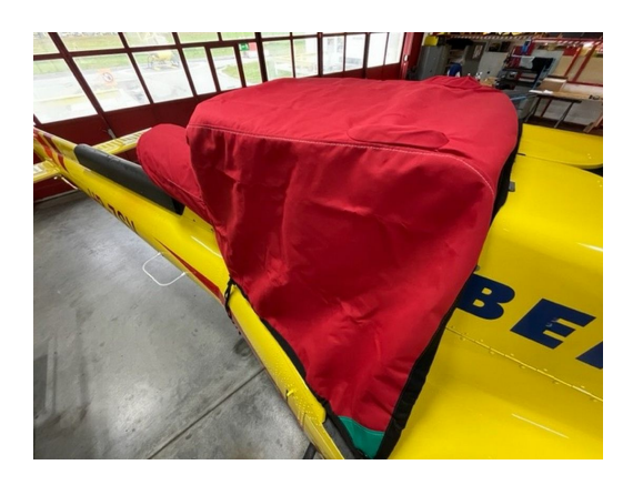
Airbus Helicopter H-125 & AS350 Intake/Exhaust Cover (newer design)