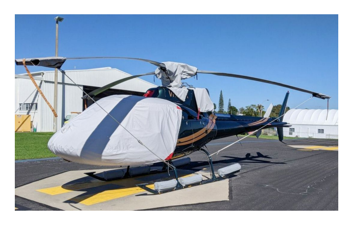
AS350 Bubble, Main Rotor, Intake & Tail Rotor Covers