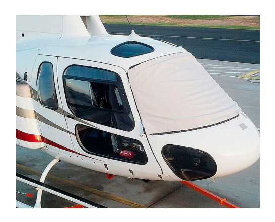
AS350 Windshield Cover, pinches in door jambs