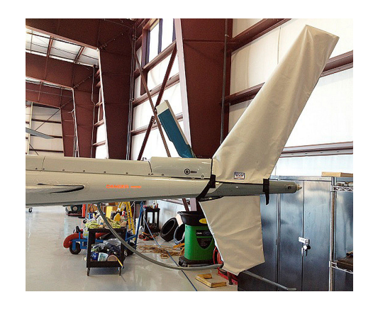
AS350 B3 Vertical Stabilizer Covers (set of 2)