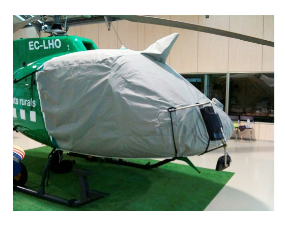
AS350 Bubble Cover with Wire Strike and Cargo Mirror