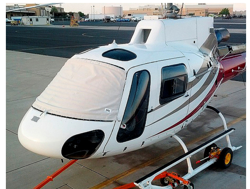
AS350 Windshield Cover, pinches in door jams