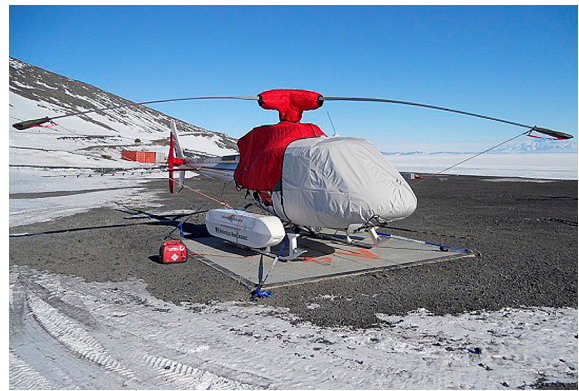
AS350 Bubble Cover w/ Cargo Mirror, Blade Tie-downs, Insulated Engine, Insulated Main Rotor Hub & Insulated Tail Rotor Covers