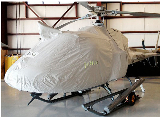
Eurocopter AS350 Main Body Cover