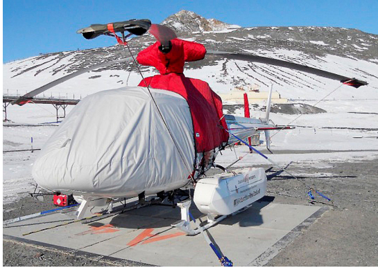
AS350 Bubble Cover w/ Cargo Mirror, Blade Tie-downs, Insulated Engine, Insulated Main Rotor Hub and Insulated Tail Rotor Covers

Travel Covers are made with Silver Solution-Dyed Polyester fabric and fully lined over the entire cover. The material is lightweight and more compact for easy stowage in the aircraft. The polyester material is water resistant, but only intended for occasional use outside. We also have an ultra lightweight material available for fitted hangar dust covers. For daily outdoor use, the non-travel Sunbrella Cover is the best choice.