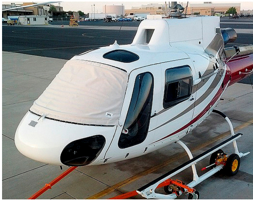
AS350 Windshield Cover, pinches in door jambs