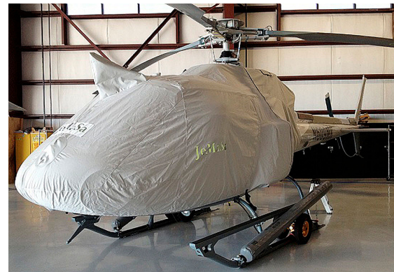
Eurocopter AS350 B3 Main Body Cover, Squirrel Cheeks