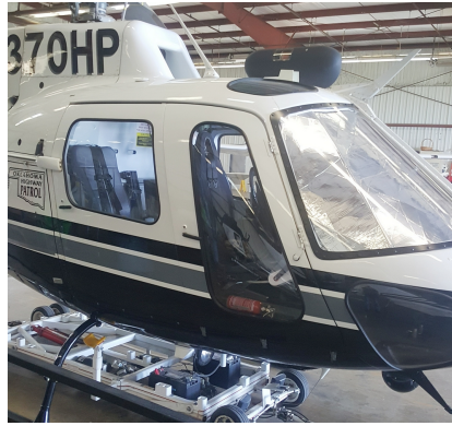
Aerospatiale AS350 Astar, Ecureuil, Esquilo, Fennec Windshield Heatshields

window framing. It folds up flat and easily stores in the included storage sleeve. Some designs may require velcro and suction cups. A Heatshield is an excellent short-term remedy for cockpit overheating.