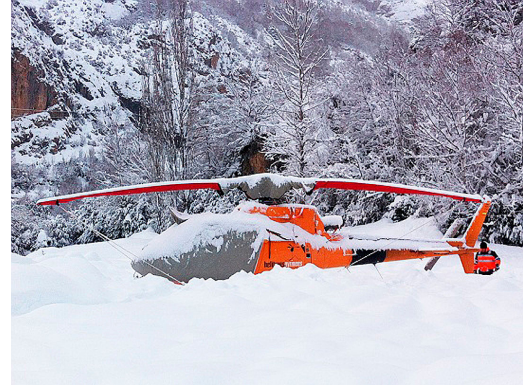
AS350 Bubble Cover, Insulated Main & Tail Rotor Covers, Blade Covers with tie-down detail