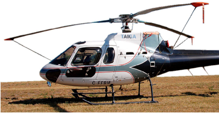
AS350 Blade Tie-Downs

WINTER USE MATERIAL - Made with Solution-Dyed Polyester fabric, this option is intended for seasonal use to aid in deicing, rain mitigation, or for occasional travel. The material is lighter and more compact, but more susceptible to UV damage and may have a shorter useful life if used continuously outside than the all-year use material.