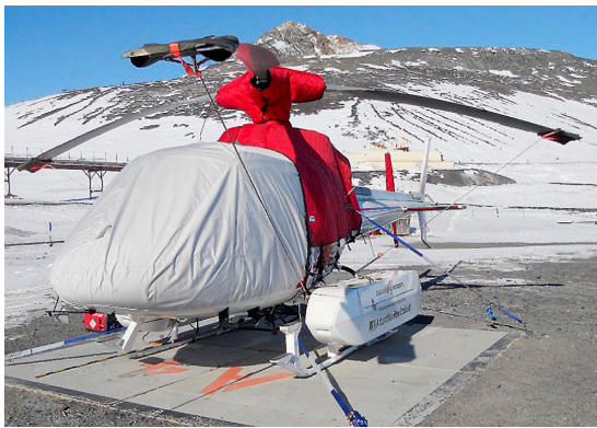
AS350 Bubble Cover w/ Cargo Mirror, Blade Tie-downs, Insulated Engine, Insulated Main Rotor Hub and Insulated Tail Rotor Covers

WINTER USE MATERIAL - Made with Solution-Dyed Polyester fabric, this option is intended for seasonal use to aid in deicing, rain mitigation, or for occasional travel. The material is lighter and more compact, but more susceptible to UV damage and may have a shorter useful life if used continuously outside than the all-year use material.