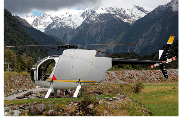
Engine Cover (illustration)