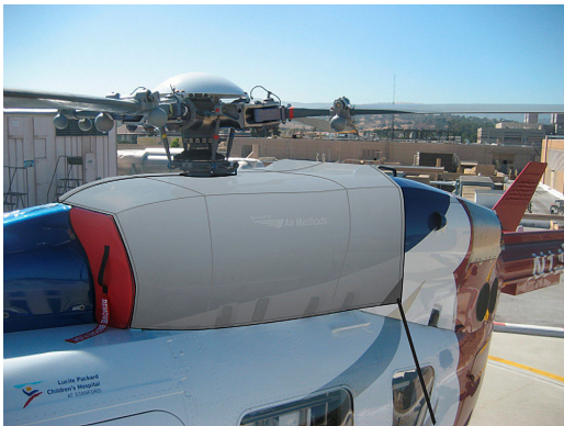
Upper Deck Plugs/Cover, extended to cover aft intake vents