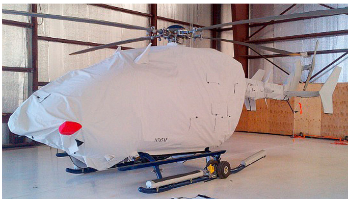
Main Body (also covers bottom), Tailboom, Vertical Pylon, Stabilizers and Tail Rotor Covers