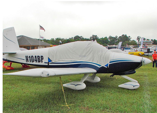
Van's RV-10 Canopy Cover