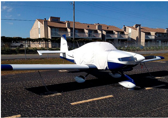
Van's RV-10 Extended Canopy Cover

This cover type is made from Silver Acrylic Sunbrella canvas and is 100% lined with a soft and smooth microfiber. Bruce's Custom Covers developed this material combination especially for aircraft protection. The outer material is medium weight and treated for water resistance, UV resistance and anti-static buildup. The inner lining is a very soft and smooth microfiber to prevent scratching. The material is very reflective, and tests show that the cabin interior temperature can be reduced to near-ambient temperature on the hottest of days. It is water, ice and snow repellent, yet breathable to allow moisture to escape from between the cover and the aircraft surface.