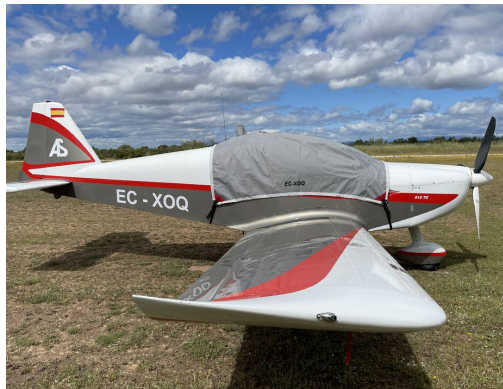
Direct Fly Alto Travel Cover, Light Weight Canopy Cover

Travel Covers are made with Silver Solution-Dyed Polyester fabric and only lined over the windshield to save weight. The material is lightweight and more compact for easy stowage in the aircraft. The polyester material is water resistant, but only intended for occasional use outside. We also have an ultra lightweight material available for fitted hangar dust covers. For daily outdoor use, the non-travel Sunbrella Cover is the best choice.