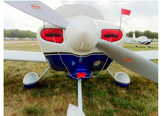
Van's RV-10 Canopy Cover & Engine Inlet Plugs