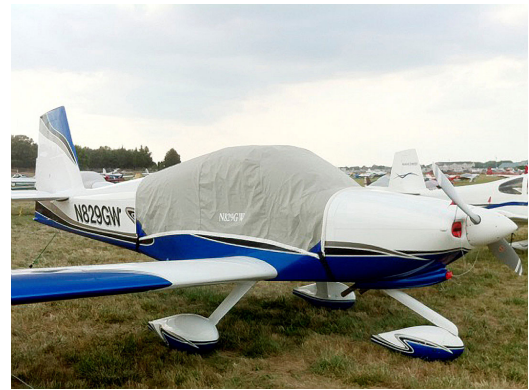
Van's RV-10 Canopy Cover & Engine Inlet Plugs