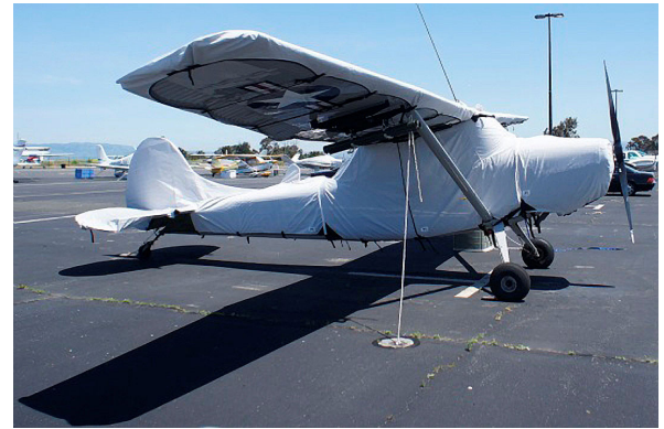
Wing Covers on Cessna Bird Dog