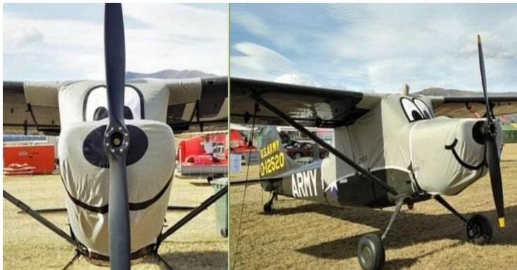
Cessna L-19 Bird Dog Canopy Cover, Engine Cover