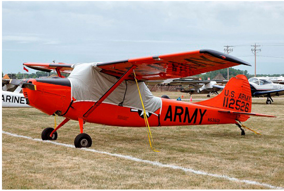
Cessna L-19 Bird Dog Canopy Cover

the hottest of days. It is water, ice and snow repellent, yet breathable to allow moisture to escape from between the cover and the aircraft surface.