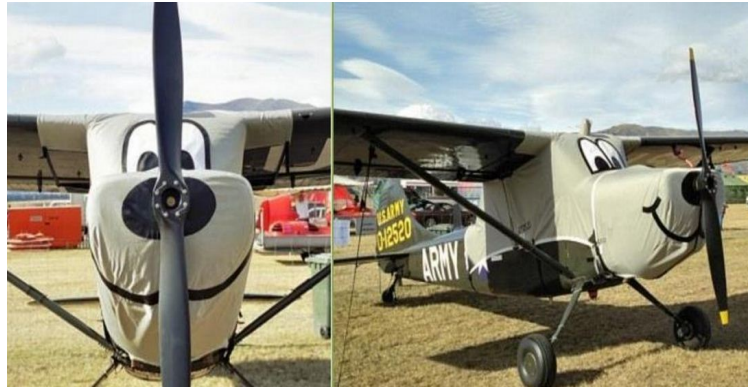
Cessna L-19 Bird Dog Canopy Cover, Engine Cover