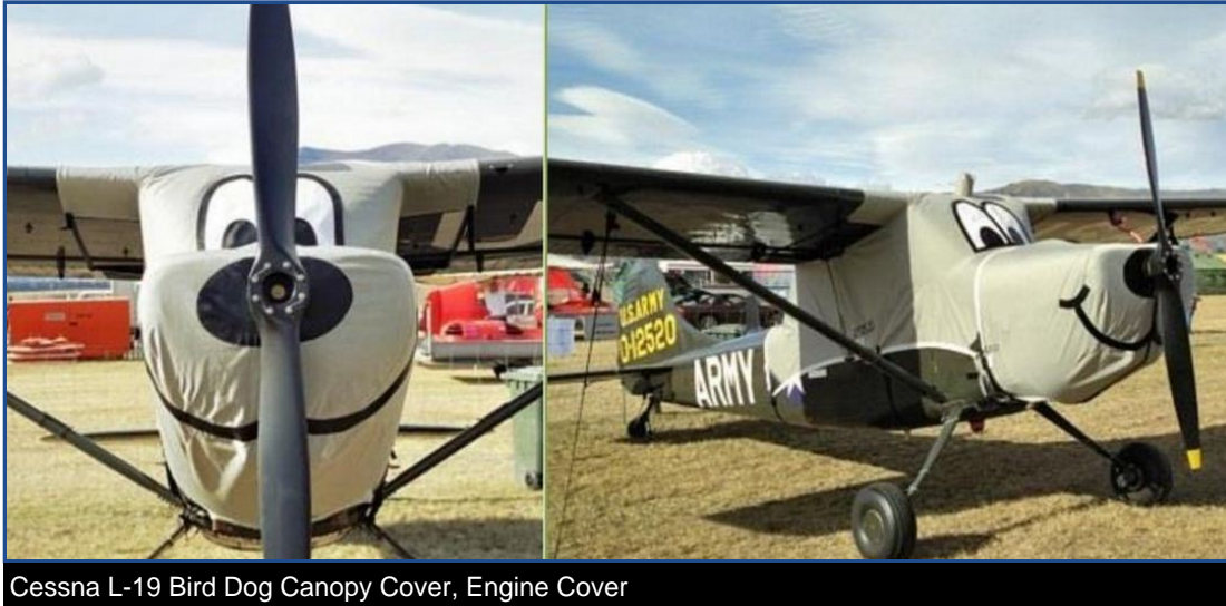
Cessna L-19 Bird Dog Canopy Cover, Engine Cover