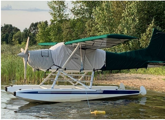
Cessna A185F Complete Cover Set

the hottest of days. It is water, ice and snow repellent, yet breathable to allow moisture to escape from between the cover and the aircraft surface.