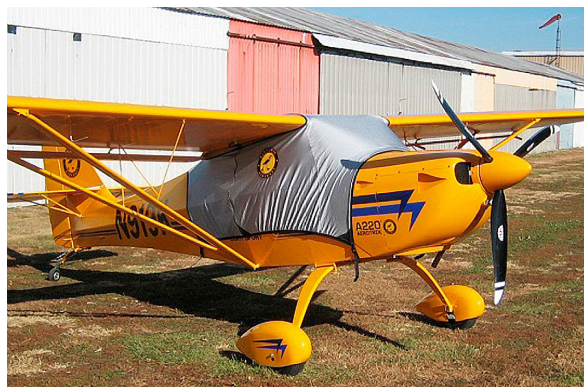
Aerotrek A220 Fitted Hangar Dust Cover