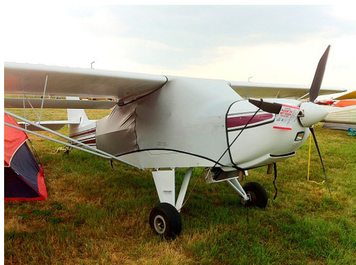
Kitfox Spandex FlyAway Travel Canopy Cover

Travel Covers are made with Silver Solution-Dyed Polyester fabric and only lined over the windshield to save weight. The material is lightweight and more compact for easy stowage in the aircraft. The polyester material is water resistant, but only intended for occasional use outside. We also have an ultra lightweight material available for fitted hangar dust covers. For daily outdoor use, the non-travel Sunbrella Cover is the best choice.