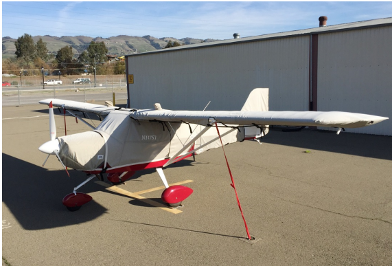
Eurofox Canopy, Engine, Wings and Empennage Covers