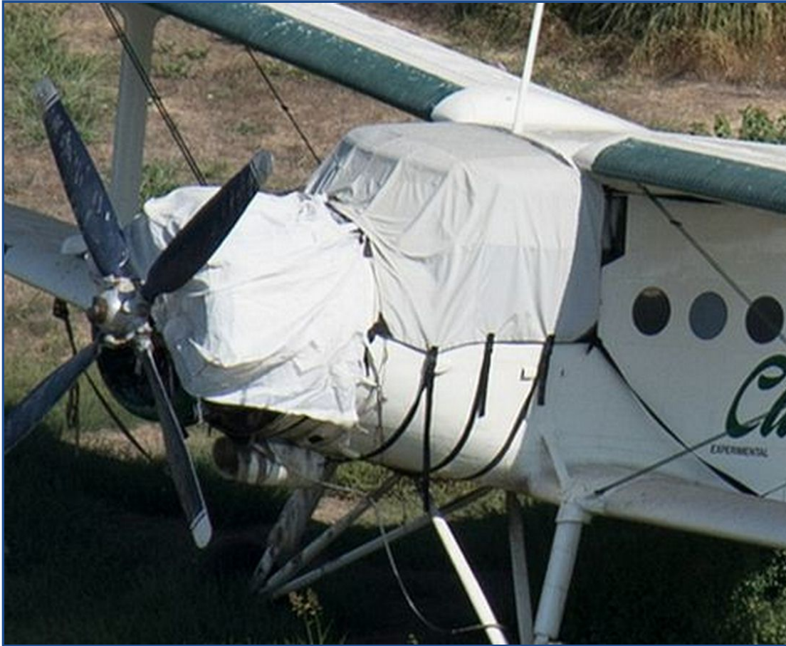
Antonov AN-2 Cockpit and Engine Covers