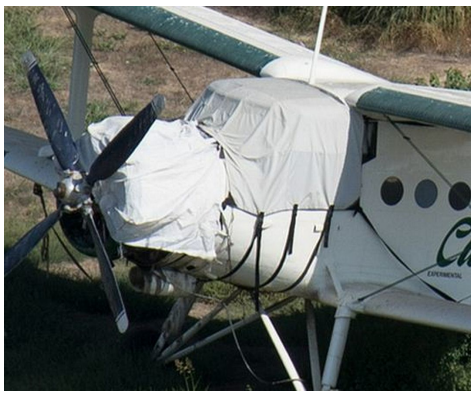
Antonov AN-2 Cockpit and Engine Covers