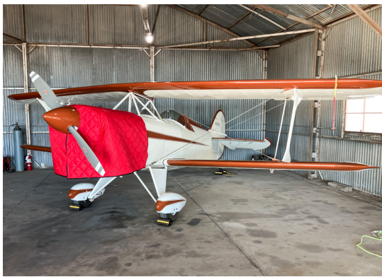
SKYBOLT, Insulated Hangar Blanket, Custom Fit Interior Use)