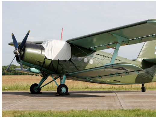
Antonov AN-2 Colt Canopy/Cockpit Cover