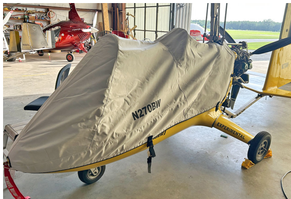
American Ranger AR-1 Gyrocopter Canopy/Nose Cover