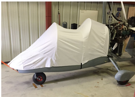
Magni M16 Autogyro Canopy/Nose Cover, test fit cover