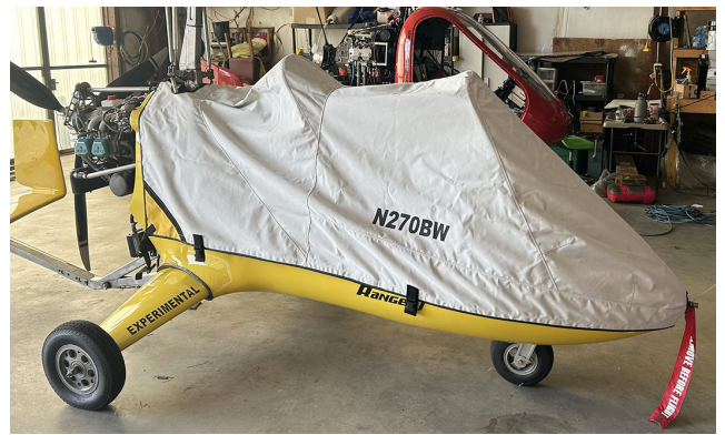
American Ranger AR-1 Gyrocopter Canopy/Nose Cover