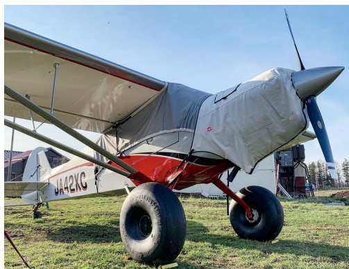
Cub Crafters Carbon Cub Travel Weight Canopy Cover Cub Crafters CC19 X-Cub Engine Cover, Travel Weight Canopy Cover