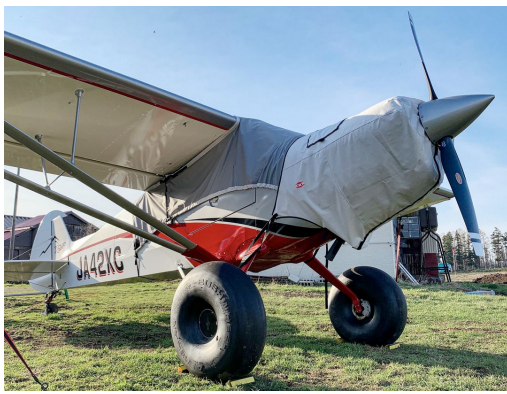
Cub Crafters CC19 X-Cub Engine Cover, Travel Weight Canopy Cover