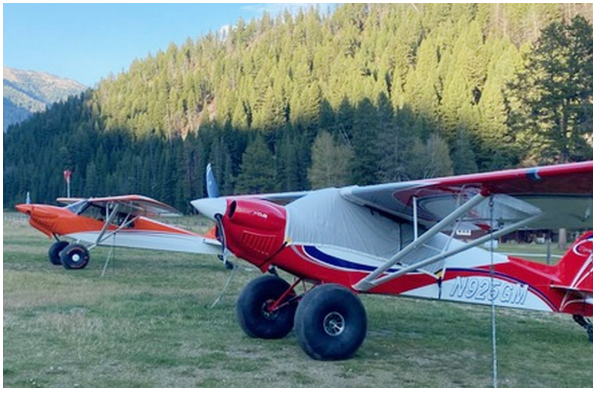
Cub Crafters CCX-2300 Canopy Cover