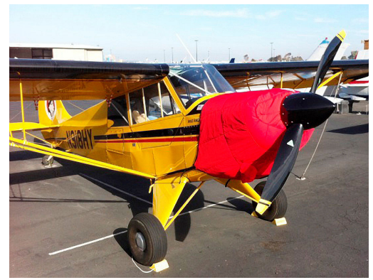
Aviat Husky Insulated Engine Cover