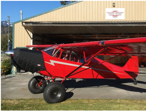
Piper PA-12 Insulated Engine Cover