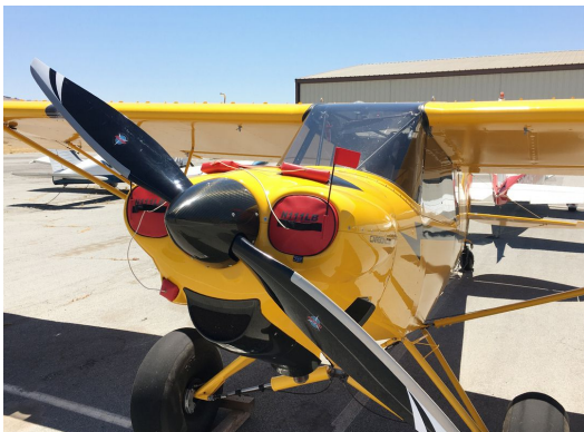
Cub Crafters CC-11 Carbon Cub Engine Plugs

Engine Inlet Plugs are custom fit for your Lewaero Ascender intakes, made with heavy-duty vinyl material, and stuffed with a single block of sculpted urethane foam. Each plug has a zipper that allows the foam to be removed and dried if necessary. Engine plugs have warning flags that are visible from the cockpit or 'remove before flight' streamers sewn onto the face of the plugs. Most plugs are imprinted with the aircraft registration number in black for an extra charge. Storage bag NOT included. Engine plugs may be inserted after flight when the engine is still warm. Engine Inlet Plugs are commonly referred to as Cowl Plugs, Intake Plugs, Cowl Blocks, Engine Blocks, and Engine Bungs.