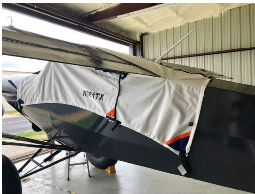
CubCrafters CCK-2000 Over The Top Canopy Cover