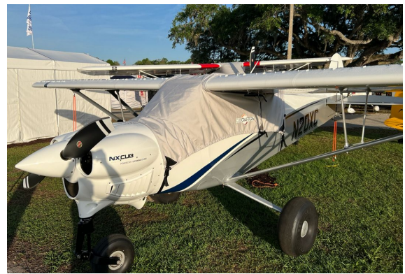
Cub Crafters CC-18 Canopy Cover