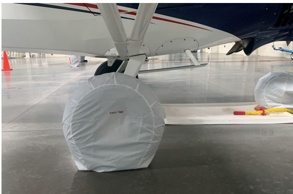
Cub Crafters Tire Covers, tricycle gear, test fit covers

ALL-YEAR USE MATERIAL - Made with Silver Acrylic Sunbrella canvas, the all-year use material is the best option for sun protection and cover longevity. This heavier more durable material is intended for all weather conditions, such as rain and snow or lots of sun.