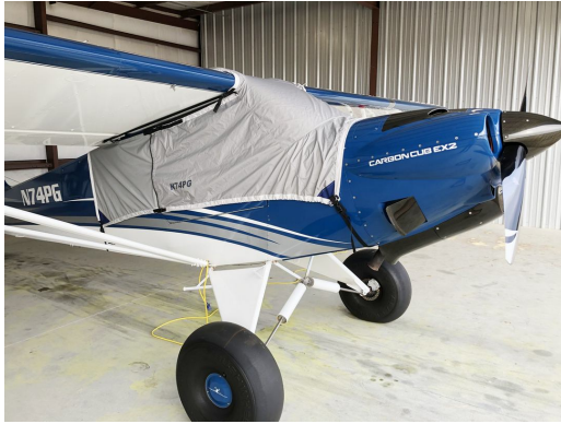
Cub Crafters Carbon Cub Travel Weight Canopy Cover

Travel Covers are made with Silver Solution-Dyed Polyester fabric and only lined over the windshield to save weight. The material is lightweight and more compact for easy stowage in the aircraft. The polyester material is water resistant, but only intended for occasional use outside. We also have an ultra lightweight material available for fitted hangar dust covers. For daily outdoor use, the non-travel Sunbrella Cover is the best choice.