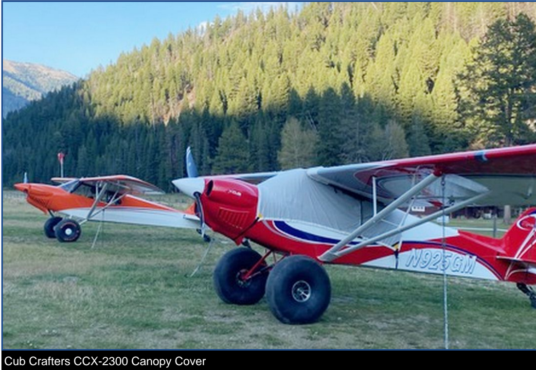
Cub Crafters CCX-2300 Canopy Cover