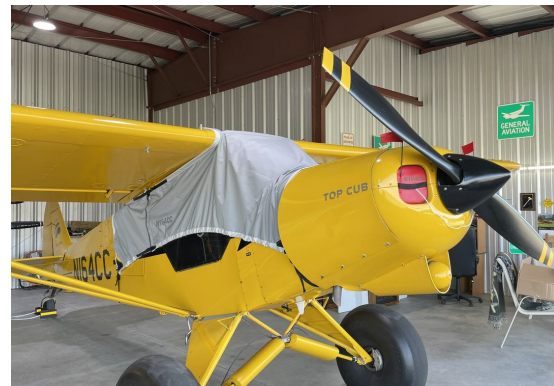
Cub Crafters CC-18 Light Weight Travel Canopy Cover, Engine Plugs