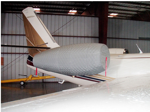
IAI Westwind Insulated Engine Nacelle Cover