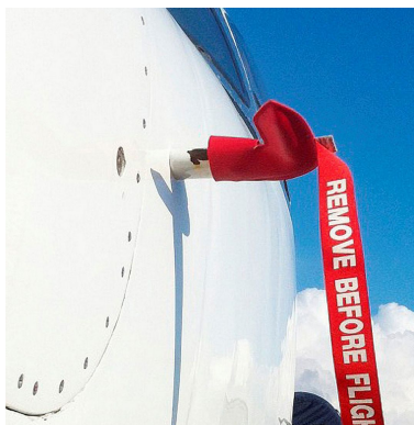
Westwind 1125 Astra Pitot Cover, Heat Resistant Type

The Engine Inlet Plugs are custom fit for your Israel Aircraft Industries Astra (C-38) intakes, made with heavy-duty vinyl material, and stuffed with a single block of sculpted urethane foam. Each plug has a zipper that allows the foam to be removed and dried if necessary. Engine plugs have 'remove before flight' streamers sewn onto the face of the plugs. Most plugs are imprinted with the aircraft registration number in black for an extra charge. Storage bag NOT included. Engine plugs may be inserted after flight when the engine is still warm. Engine Inlet Plugs are commonly referred to as Cowl Plugs, Intake Plugs, Cowl Blocks, Engine Blocks, and Engine Bungs.