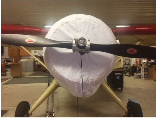
Stinson V77 Insulated Engine Cover, test fit cover