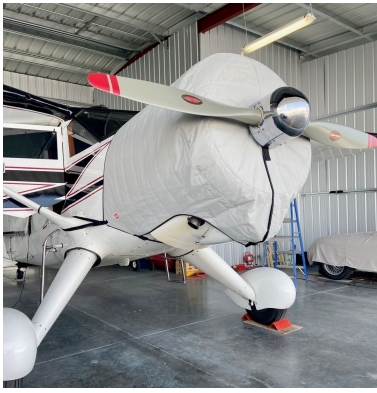
Stinson Reliant V-77, SR, AT-19 Insulated Engine Cover