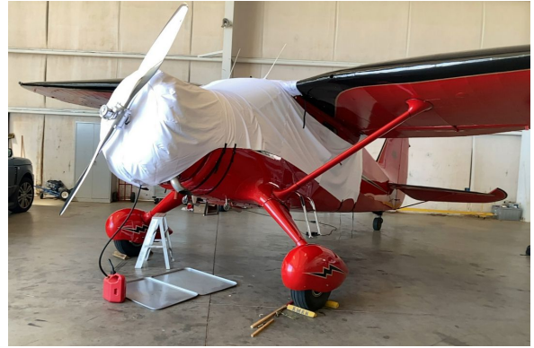
Stinson Reliant Over-Top Canopy/Engine Cover