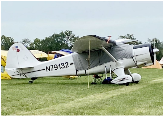
Consolidated Vultee V-77 Travel Cover