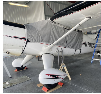
Consolidated Vultee V-77 Travel Cover