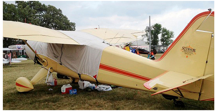
Stinson Reliant Over-the-top Canopy, Engine, and Propeller Cover