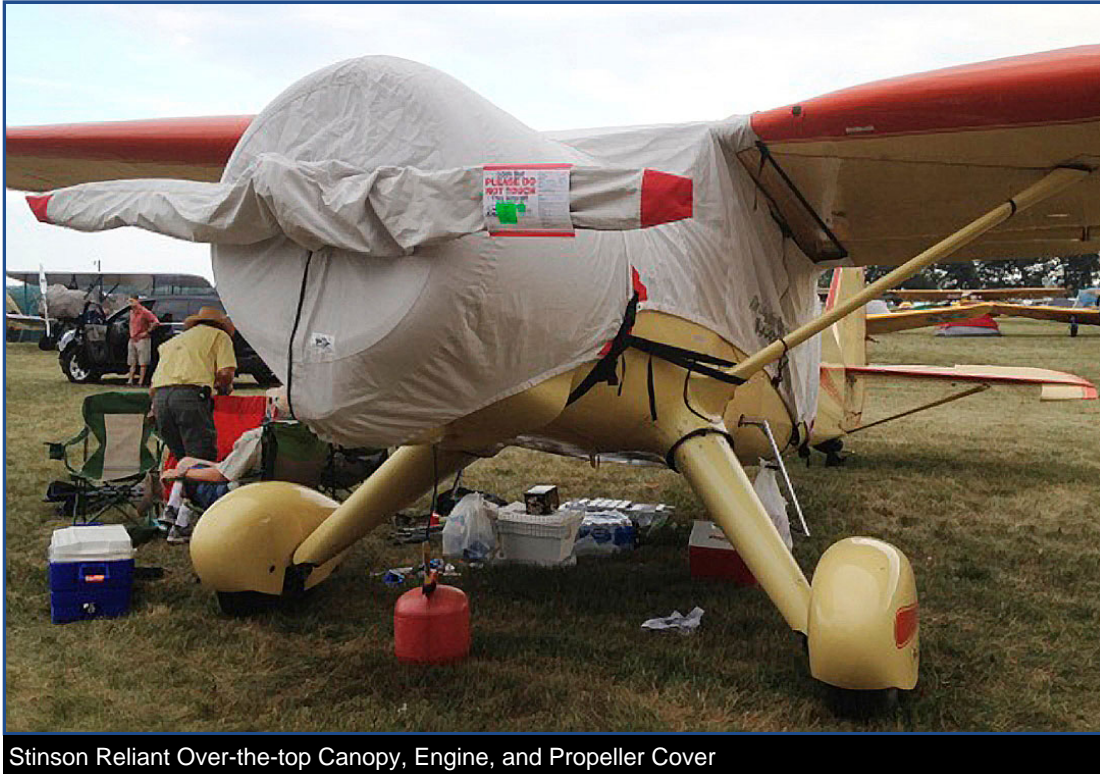
Stinson Reliant Over-the-top Canopy, Engine, and Propeller Cover