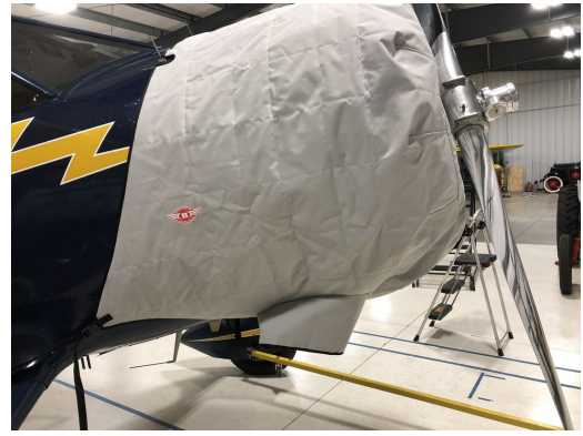
Stinson Reliant SR-10 Insulated Engine Cover