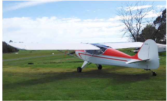
Auster J5 Autocar Wing Covers