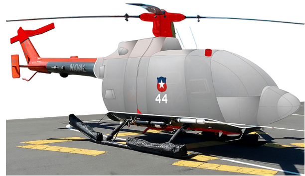
MBB BO-105 Full Body, Rotor Mast & Tail Rotor Covers (illustration)