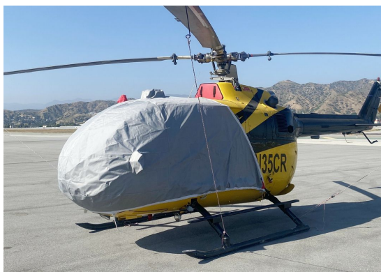
Eurocopter BO-105 Bubble Cover, Standard Model