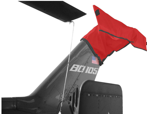
MBB BO-105 Tail Rotor/Gearbox Cover