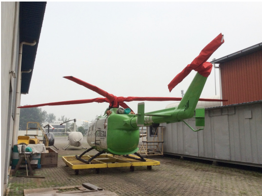
MBB BO-105 Blade, Rotor Head & Tail Rotor Covers

WINTER USE MATERIAL - Made with Solution-Dyed Polyester fabric, this option is intended for seasonal use to aid in deicing, rain mitigation, or for occasional travel. The material is lighter and more compact, but more susceptible to UV damage and may have a shorter useful life if used continuously outside than the all-year use material.