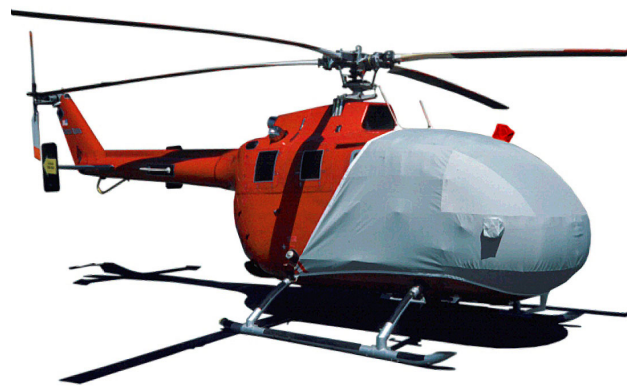
MBB BO-105 Bubble Cover