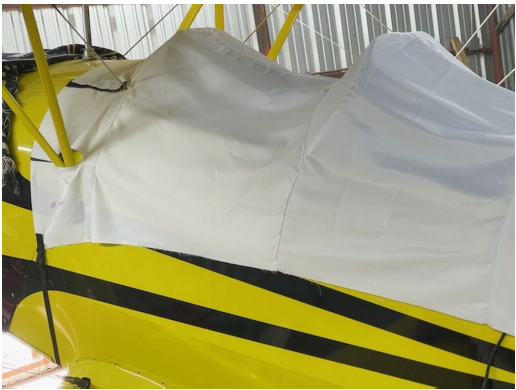
Bucker Jungmann BU-131 Canopy Cover, test fit cover