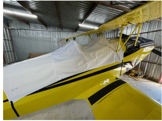
Bucker Jungmann BU-131 Canopy Cover, test fit cover