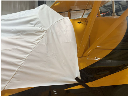
Bucher BU-133 Jungmeister Canopy Cover, test fit cover

the hottest of days. It is water, ice and snow repellent, yet breathable to allow moisture to escape from between the cover and the aircraft surface.