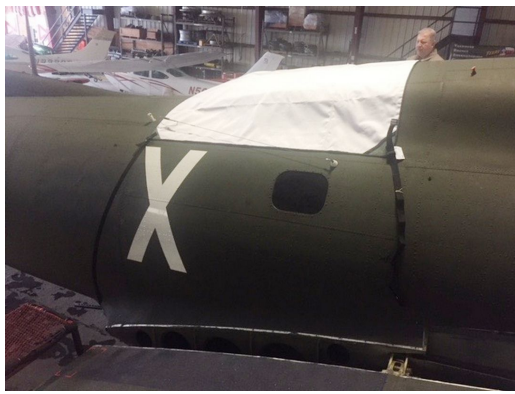
Hatch Cover on a classic B17.