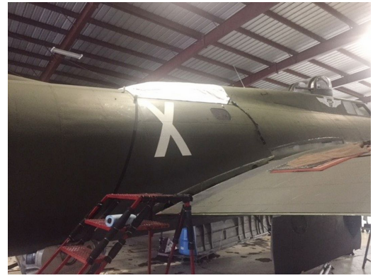
Hatch Cover on a classic B17.