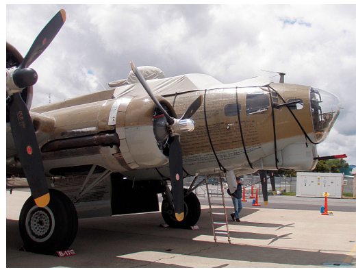
B-17 Canopy/Gun Turret Cover