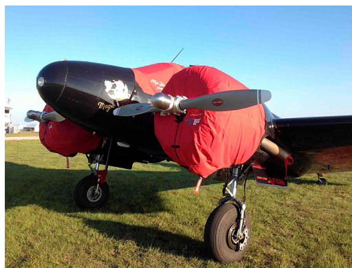
Twin Beech 18 Cockpit & Engine Covers, Younkin Airshow model