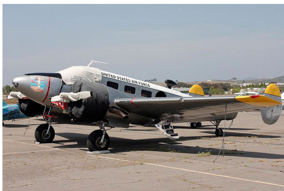
Twin Beech 18 Cockpit, Engine & Prop Covers