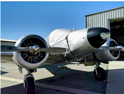
Beech Super 18 Cockpit Cover

This cover type is made from Silver Acrylic Sunbrella canvas and is 100% lined with a soft and smooth microfiber. Bruce's Custom Covers developed this material combination especially for aircraft protection. The outer material is medium weight and treated for water resistance, UV resistance and anti-static buildup. The inner lining is a very soft and smooth microfiber to prevent scratching. The material is very reflective, and tests show that the cabin interior temperature can be reduced to near-ambient temperature on the hottest of days. It is water, ice and snow repellent, yet breathable to allow moisture to escape from between the cover and the aircraft surface.