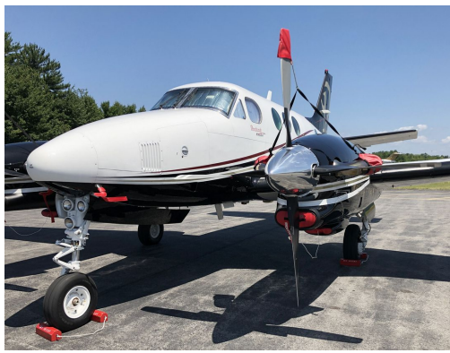
Beech C90A Prop Tie Downs/Exhaust Covers