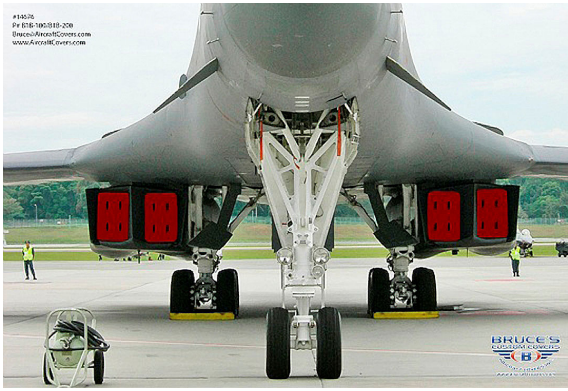
B1-B Bomber Intake Plugs