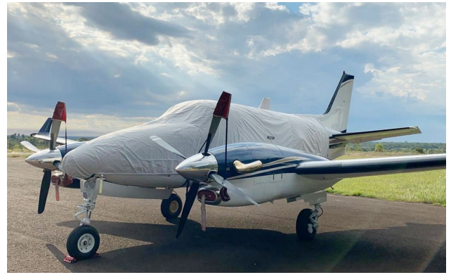
King Air C90GTi Canopy/Nose Cover