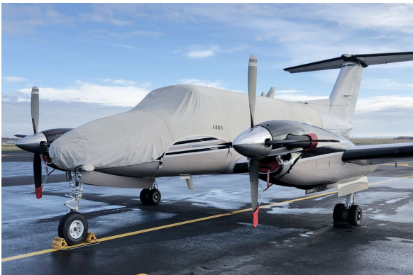
Raytheon King Air B200GT Canopy/Nose Cover