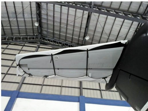
Beech King Air B350 Horizontal Stabilizer Covers

WINTER USE MATERIAL - Made with Solution-Dyed Polyester fabric, this option is intended for seasonal use to aid in deicing, rain mitigation, or for occasional travel. The material is lighter and more compact, but more susceptible to UV damage and may have a shorter useful life if used continuously outside than the all-year use material.