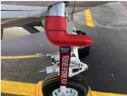
Raytheon King Air B200GT Pitot Tube Cover.

Engine Inlet Plugs are custom fit for your Beech King Air 200, 250, 260 (C-12, RC-12, UC-12) intakes, made with heavy-duty vinyl material, and stuffed with a single block of sculpted urethane foam. Each plug has a zipper that allows the foam to be removed and dried if necessary. Engine plugs have warning flags that are visible from the cockpit or 'remove before flight' streamers sewn onto the face of the plugs. Most plugs are imprinted with the aircraft registration number in black for an extra charge. Storage bag NOT included. Engine plugs may be inserted after flight when the engine is still warm. Engine Inlet Plugs are commonly referred to as Cowl Plugs, Intake Plugs, Cowl Blocks, Engine Blocks, and Engine Bungs.