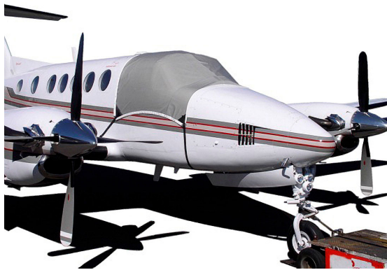
King Air 200/300 Snap-On Windshield Cover

Travel Covers are made with Silver Solution-Dyed Polyester fabric and only lined over the windshield to save weight. The material is lightweight and more compact for easy stowage in the aircraft. The polyester material is water resistant, but only intended for occasional use outside. We also have an ultra lightweight material available for fitted hangar dust covers. For daily outdoor use, the non-travel Sunbrella Cover is the best choice.