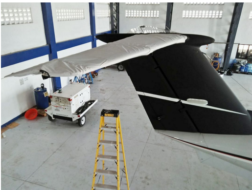
Beech King Air B350 Horizontal Stabilizer Covers