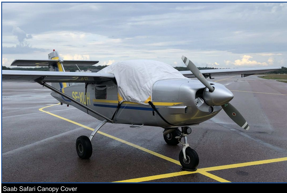
Saab Safari Canopy Cover