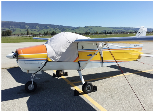
Bolkow Junior 208 Canopy Cover