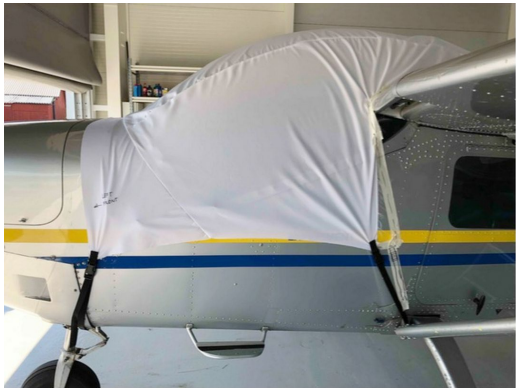
Saab Safari Canopy Cover, test fit cover