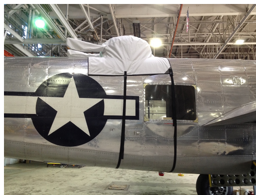
B25 Gun Turret Cover