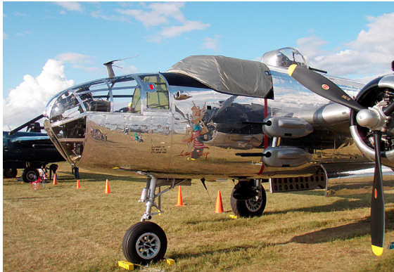
Mitchell B25 Cockpit Cover (Snap-On Type)

Engine Inlet Plugs are custom fit for your North American Mitchell B25 intakes, made with heavy-duty vinyl material, and stuffed with a single block of sculpted urethane foam. Each plug has a zipper that allows the foam to be removed and dried if necessary. Engine plugs have warning flags that are visible from the cockpit or 'remove before flight' streamers sewn onto the face of the plugs. Most plugs are imprinted with the aircraft registration number in black for an extra charge. Storage bag NOT included. Engine plugs may be inserted after flight when the engine is still warm. Engine Inlet Plugs are commonly referred to as Cowl Plugs, Intake Plugs, Cowl Blocks, Engine Blocks, and Engine Bung.