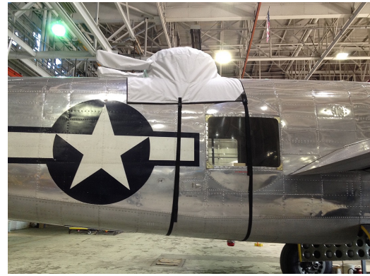
B25 Gun Turret Cover