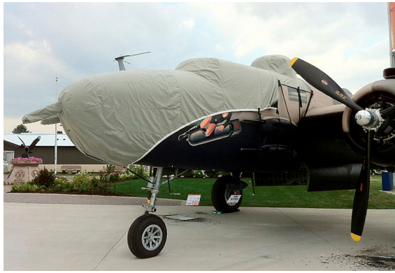
B25 Cockpit/Nose and Gun Turret Covers