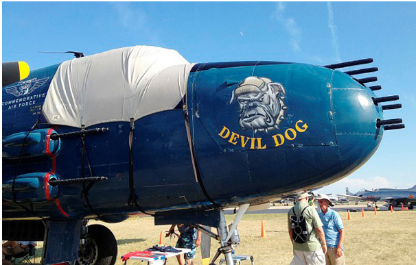
Mitchell B25 Cockpit Cover w/ Custom Imprint (Bellystrap Type)

This cover type is made from Silver Acrylic Sunbrella canvas and is 100% lined with a soft and smooth microfiber. Bruce's Custom Covers developed this material combination especially for aircraft protection. The outer material is medium weight and treated for water resistance, UV resistance and anti-static buildup. The inner lining is a very soft and smooth microfiber to prevent scratching. The material is very reflective, and tests show that the cabin interior temperature can be reduced to near-ambient temperature on the hottest of days. It is water, ice and snow repellent, yet breathable to allow moisture to escape from between the cover and the aircraft surface.