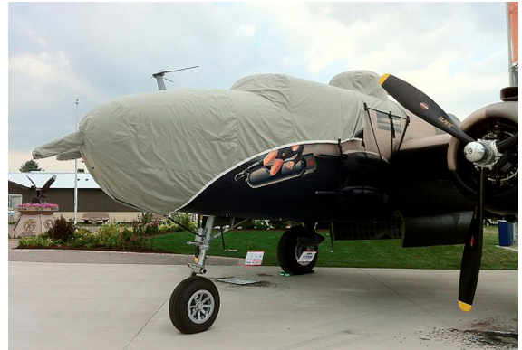
B26 Cockpit/Nose and Gun Turret Covers