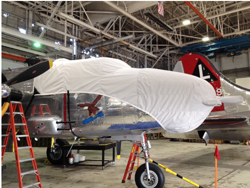
B26 Cockpit/Nose Cover

This cover type is made from Silver Acrylic Sunbrella canvas and is 100% lined with a soft and smooth microfiber. Bruce's Custom Covers developed this material combination especially for aircraft protection. The outer material is medium weight and treated for water resistance, UV resistance and anti-static buildup. The inner lining is a very soft and smooth microfiber to prevent scratching. The material is very reflective, and tests show that the cabin interior temperature can be reduced to near-ambient temperature on the hottest of days. It is water, ice and snow repellent, yet breathable to allow moisture to escape from between the cover and the aircraft surface.