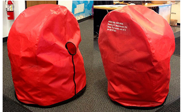
Boeing 757 Tire Covers, great for Wash Prep or Storage