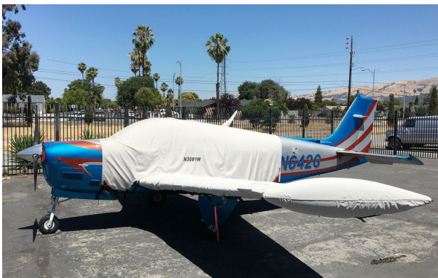
Beech Bonanza A36 Extended Canopy, Wing Covers with D'Shannon Tip Tanks