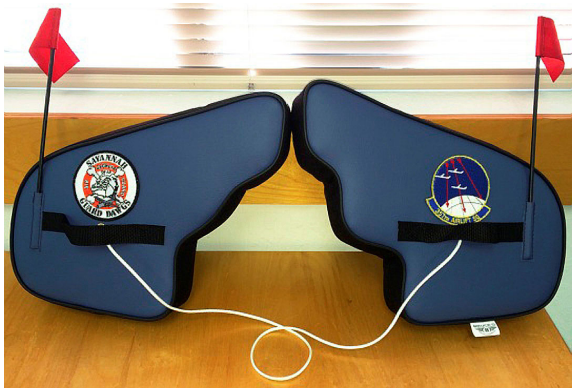
Custom Plug Colors Available, contact us for details!