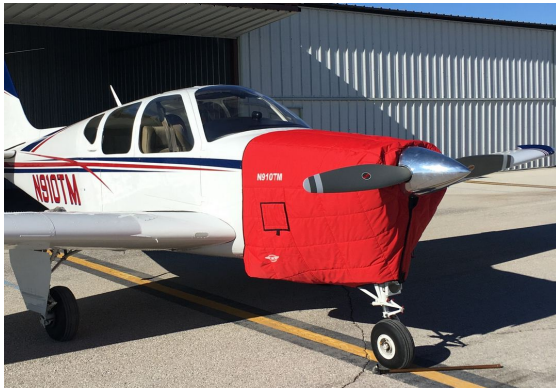
Beech Debonair Insulated Engine Cover