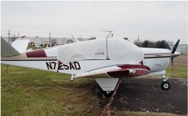
Beech Bonanza Canopy Cover