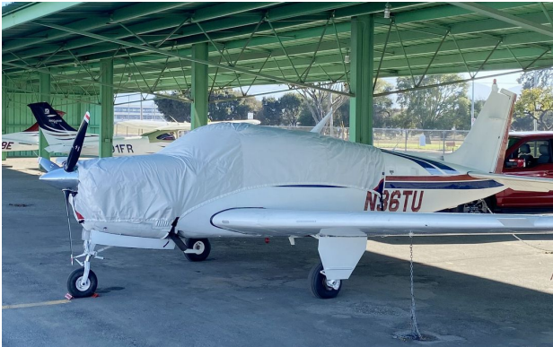
Beech B36TC Canopy/Engine Cover

This cover type is made from Silver Acrylic Sunbrella canvas and is 100% lined with a soft and smooth microfiber. Bruce's Custom Covers developed this material combination especially for aircraft protection. The outer material is medium weight and treated for water resistance, UV resistance and anti-static buildup. The inner lining is a very soft and smooth microfiber to prevent scratching. The material is very reflective, and tests show that the cabin interior temperature can be reduced to near-ambient temperature on the hottest of days. It is water, ice and snow repellent, yet breathable to allow moisture to escape from between the cover and the aircraft surface.