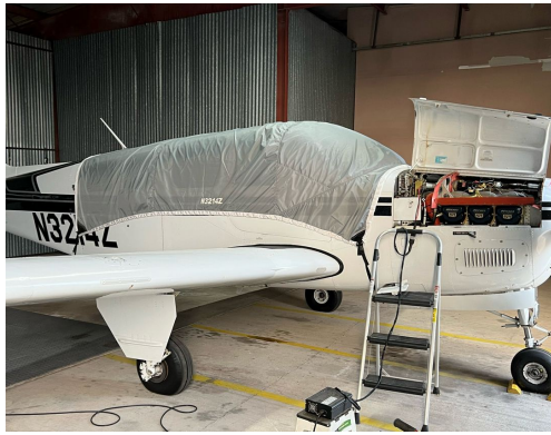
Beech A36 Light Weight Travel Canopy Cover