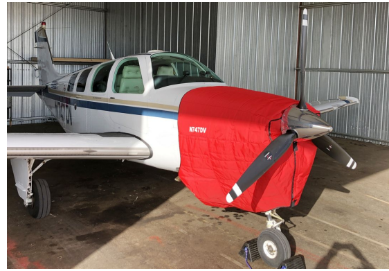
Beech Bonanza Insulated Engine Cover, fully enclosed