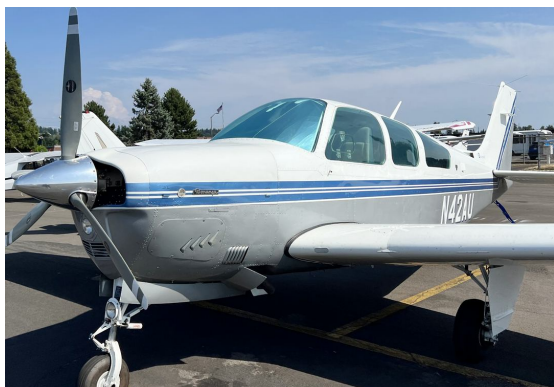
Beech Bonanza F33A Windshield HeatShield

Windshield Heatshields are interior sunshades for an aircraft's front windshield. The product is a unique composite of closed-cell foam with a silver mylar finish. The semi-rigid design is stiff enough to stand along the inside of the windshield using sun visors or window framing. It folds up flat and easily stores in the included storage sleeve. Some designs may require velcro and suction cups or split right and left sides. A Heatshield is an excellent short-term remedy for cockpit overheating. An external fabric cover is far more effective and practical for long-term protection.