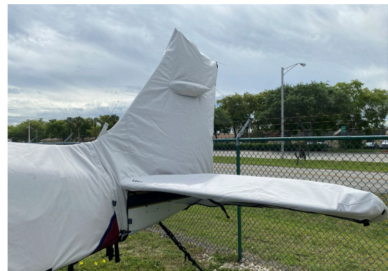
Beech Bonanza A36 Empennage Cover

WINTER USE MATERIAL - Made with Solution-Dyed Polyester fabric, this option is intended for seasonal use to aid in deicing, rain mitigation, or for occasional travel. The material is lighter and more compact, but more susceptible to UV damage and may have a shorter useful life if used continuously outside than the all-year use material.