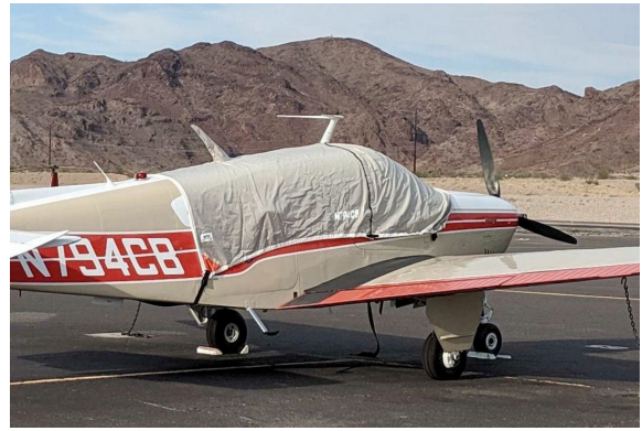
Beech Bonanza F33A Light Weight Travel Cover