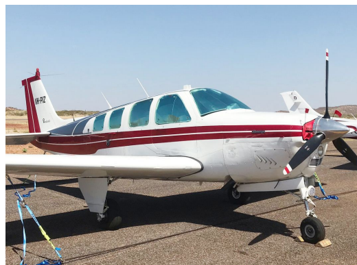
Beech A-36 Bonanza Cabin HeatShields