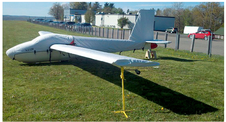
SGS 1-26B Canopy/Nose, Empennage & Wing Covers