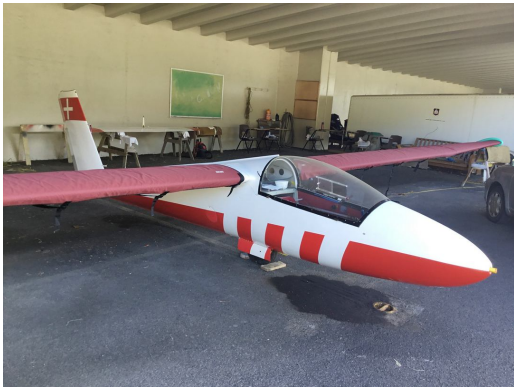
Pilatus B4 Wing Covers