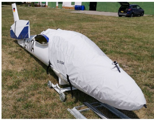
Pilatus B-4 Canopy/Nose Cover