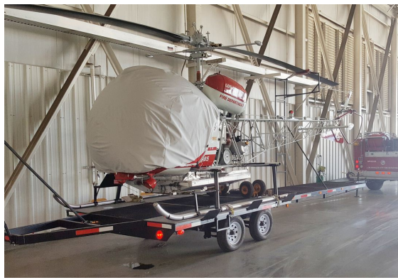
Bell 47G Bubble Cover