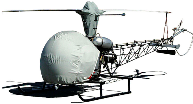
Bubble and Main Rotor Mast Covers

WINTER USE MATERIAL - Made with Solution-Dyed Polyester fabric, this option is intended for seasonal use to aid in deicing, rain mitigation, or for occasional travel. The material is lighter and more compact, but more susceptible to UV damage and may have a shorter useful life if used continuously outside than the all-year use material.