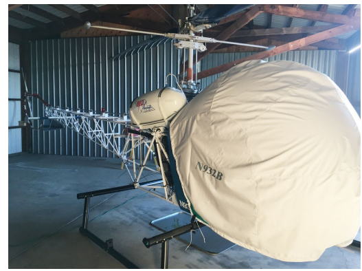
Bell 47 Bubble Cover