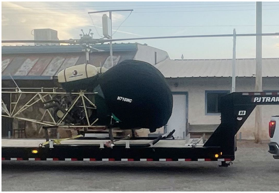
Bell 47 Bubble Cover