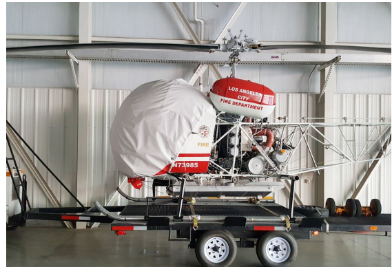
Bell 47G Bubble Cover