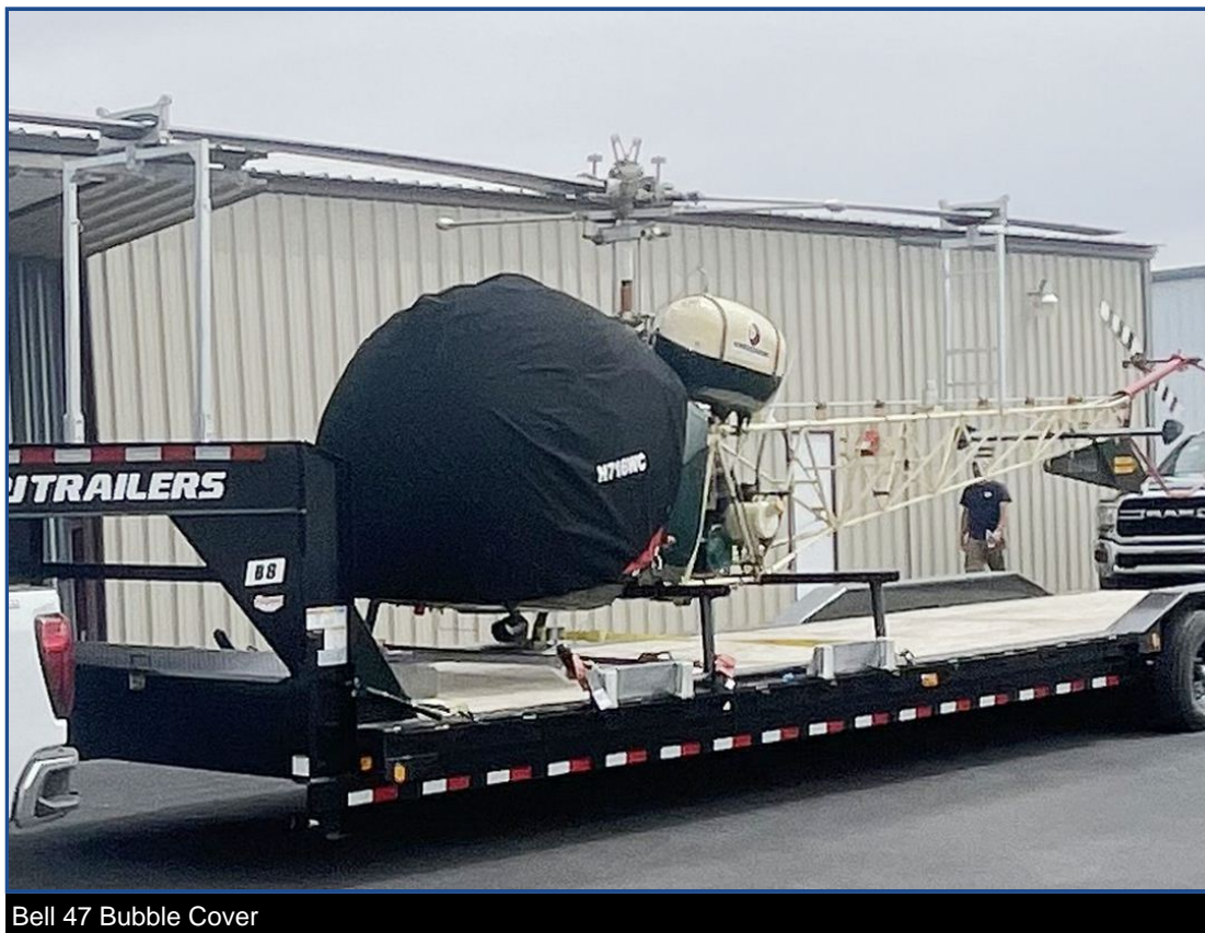
Bell 47 Bubble Cover