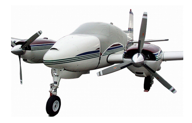
Twin Bonanza Standard Canopy Cover

Travel Covers are made with Silver Solution-Dyed Polyester fabric and only lined over the windshield to save weight. The material is lightweight and more compact for easy stowage in the aircraft. The polyester material is water resistant, but only intended for occasional use outside. We also have an ultra lightweight material available for fitted hangar dust covers. For daily outdoor use, the non-travel Sunbrella Cover is the best choice.