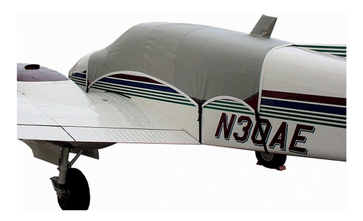
Twin Bonanza Standard Canopy Cover