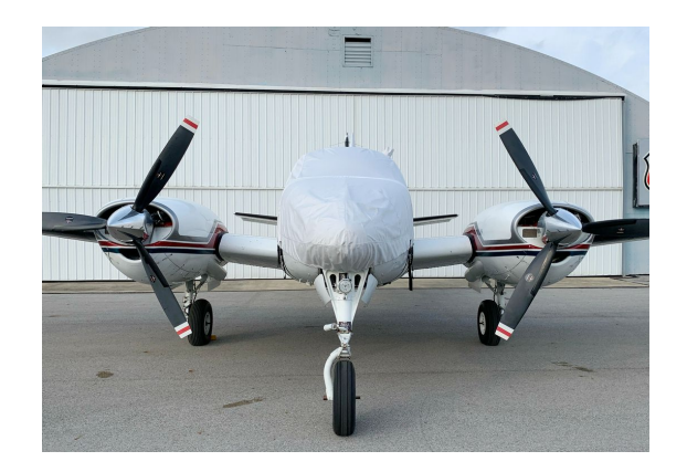
Beech Twin Bonanza Canopy/Nose Cover

This cover type is made from Silver Acrylic Sunbrella canvas and is 100% lined with a soft and smooth microfiber. Bruce's Custom Covers developed this material combination especially for aircraft protection. The outer material is medium weight and treated for water resistance, UV resistance and anti-static buildup. The inner lining is a very soft and smooth microfiber to prevent scratching. The material is very reflective, and tests show that the cabin interior temperature can be reduced to near-ambient temperature on the hottest of days. It is water, ice and snow repellent, yet breathable to allow moisture to escape from between the cover and the aircraft surface.