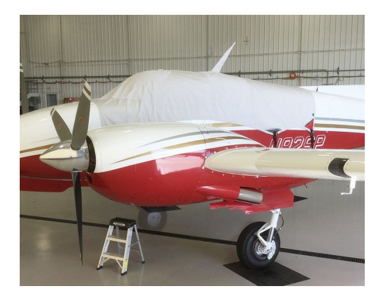
Beech Twin Bonanza D50A Canopy Cover