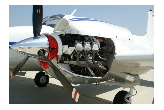
Twin Bonanza Engine Inlet Plugs