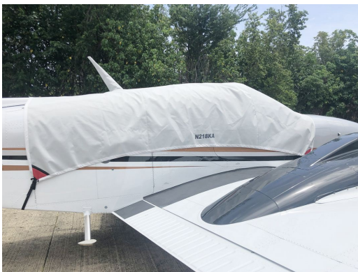
Baron G58 Travel Cover

Travel Covers are made with Silver Solution-Dyed Polyester fabric and only lined over the windshield to save weight. The material is lightweight and more compact for easy stowage in the aircraft. The polyester material is water resistant, but only intended for occasional use outside. We also have an ultra lightweight material available for fitted hangar dust covers. For daily outdoor use, the non-travel Sunbrella Cover is the best choice.