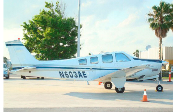
Beech Bonanza Heatshield Set