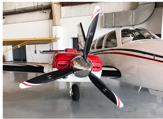
Beech Baron 58 Engine Inlet and Cowl Top Plugs, With A/C (G58 Models)