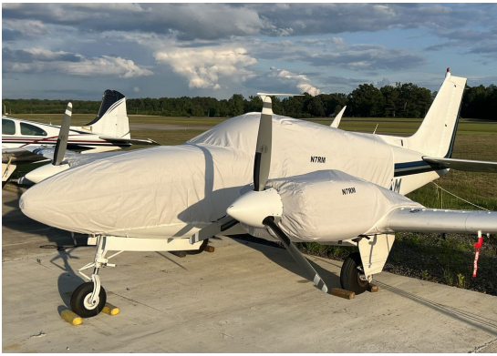
Beech C55 Baron Extended Canopy/Nose Cover, Engine Covers