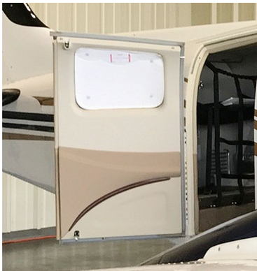
Beech Baron 58 Cabin HeatShield

Windshield Heatshields are interior sunshades for an aircraft's front windshield. The product is a unique composite of closed-cell foam with a silver mylar finish. The semi-rigid design is stiff enough to stand along the inside of the windshield using sun visors or window framing. It folds up flat and easily stores in the included storage sleeve. Some designs may require velcro and suction cups or split right and left sides. A Heatshield is an excellent short-term remedy for cockpit overheating. An external fabric cover is far more effective and practical for long-term protection.