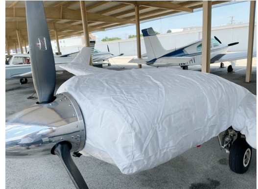
Beech Baron 58P Wing/Engine Covers (test fit)