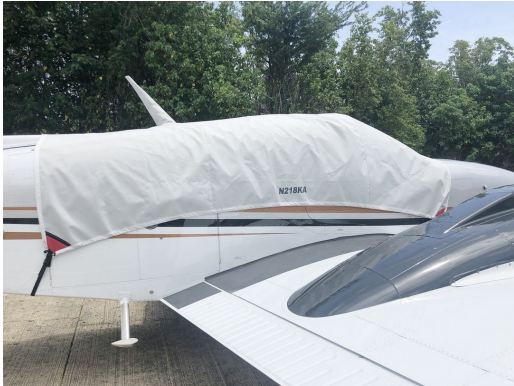
Baron G58 Travel Cover

Travel Covers are made with Silver Solution-Dyed Polyester fabric and only lined over the windshield to save weight. The material is lightweight and more compact for easy stowage in the aircraft. The polyester material is water resistant, but only intended for occasional use outside. We also have an ultra lightweight material available for fitted hangar dust covers. For daily outdoor use, the non-travel Sunbrella Cover is the best choice.