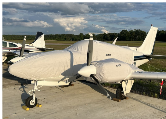
Beech C55 Baron Extended Canopy/Nose Cover, Engine Covers