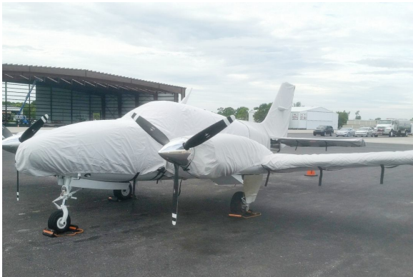
Full Cover Set (58P-020, 58P-225, 58P-405)

WINTER USE MATERIAL - Made with Solution-Dyed Polyester fabric, this option is intended for seasonal use to aid in deicing, rain mitigation, or for occasional travel. The material is lighter and more compact, but more susceptible to UV damage and may have a shorter useful life if used continuously outside than the all-year use material.