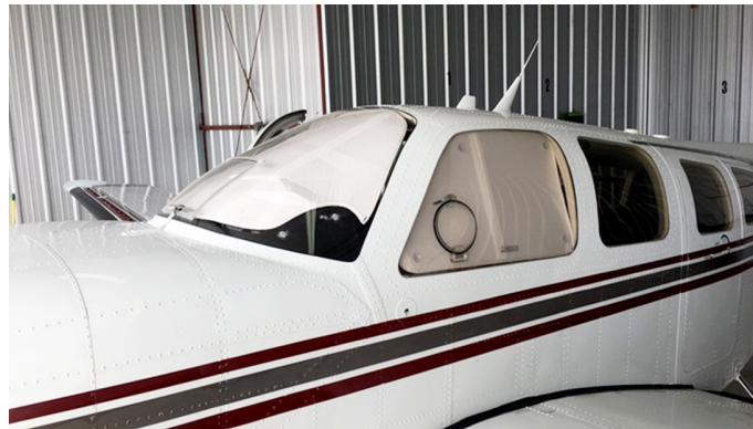
Beech Baron 58P Cockpit Heatshield Set