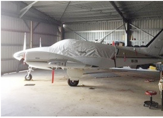
Beech Baron B-55 Canopy Cover