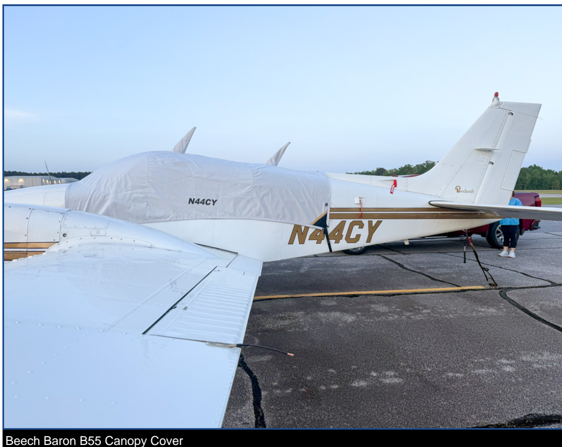
Beech Baron B55 Canopy Cover