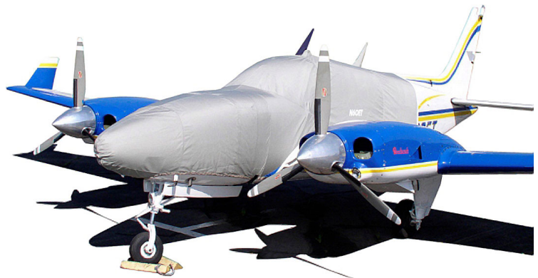
Baron Canopy/Nose Cover