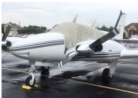
Beech Baron Canopy Cover