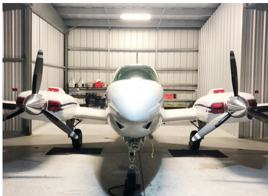
Beech Baron Engine Plugs

Engine Inlet Plugs are custom fit for your Beech Baron 58, G58 intakes, made with heavy-duty vinyl material, and stuffed with a single block of sculpted urethane foam. Each plug has a zipper that allows the foam to be removed and dried if necessary. Engine plugs have warning flags that are visible from the cockpit or 'remove before flight' streamers sewn onto the face of the plugs. Most plugs are imprinted with the aircraft registration number in black for an extra charge. Storage bag NOT included. Engine plugs may be inserted after flight when the engine is still warm. Engine Inlet Plugs are commonly referred to as Cowl Plugs, Intake Plugs, Cowl Blocks, Engine Blocks, and Engine Bungs.