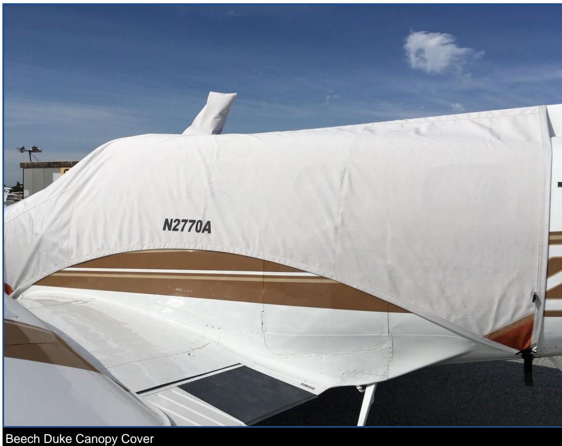
Beech Duke Canopy Cover