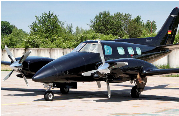
Beech Duke Cockpit HeatShields

Windshield Heatshields are interior sunshades for an aircraft's front windshield. The product is a unique composite of closed-cell foam with a silver mylar finish. The semi-rigid design is stiff enough to stand along the inside of the windshield using sun visors or window framing. It folds up flat and easily stores in the included storage sleeve. Some designs may require velcro and suction cups or split right and left sides. A Heatshield is an excellent short-term remedy for cockpit overheating. An external fabric cover is far more effective and practical for long-term protection.