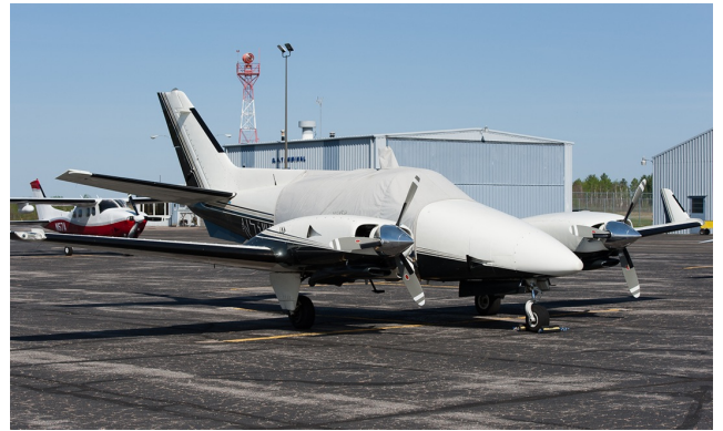
Beech Duke Canopy Cover