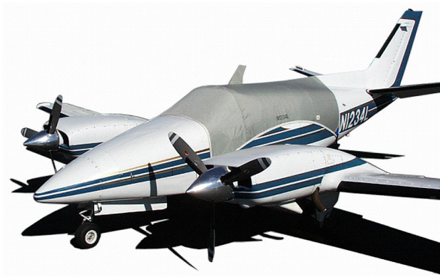
Beech Duke Standard Canopy Cover