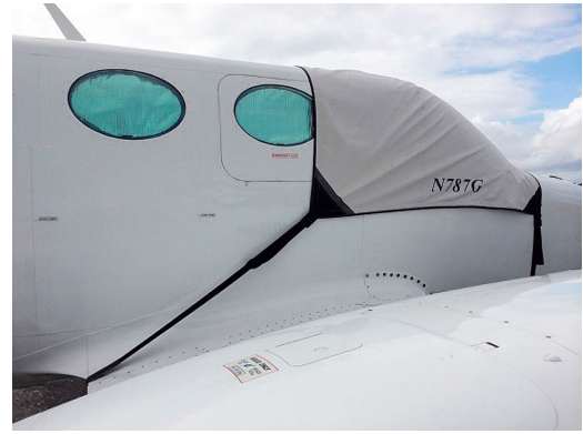
Cessna 340 Cockpit/Windshield Cover