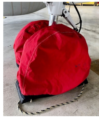
Beech King Air 300 Tire Covers (main gear)