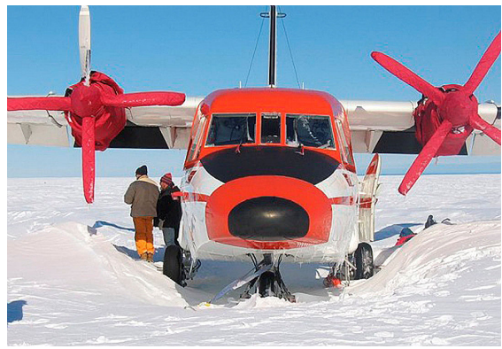
Casa 212 Insulated Engine & Propellor/Spinner Covers