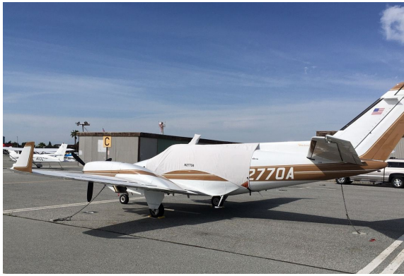
Beech Duke Canopy Cover