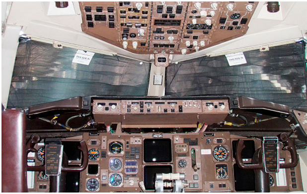
Boeing 757 Cockpit HeatShield set