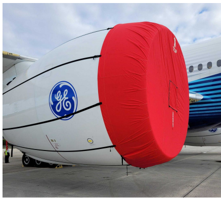
Boeing 747 Intake Covers, GE Engines