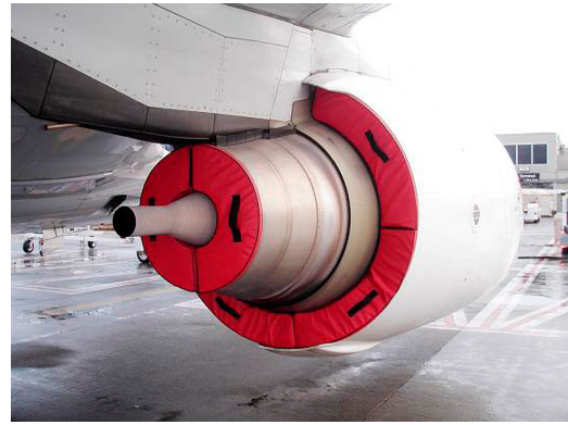
Boeing 737 Bypass and Exhaust Plugs