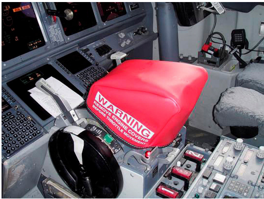
Boeing Throttle Quadrant Cover