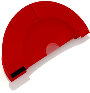
Airbus A330 Intake Plug, framed bi-fold type