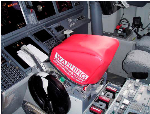
Boeing Throttle Quadrant Cover

ALL-YEAR USE MATERIAL - Made with Silver Acrylic Sunbrella canvas, the all-year use material is the best option for sun protection and cover longevity. This heavier more durable material is intended for all weather conditions, such as rain and snow or lots of sun.