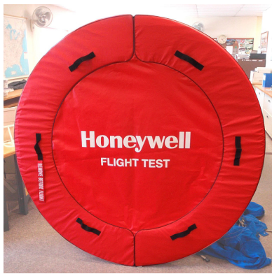
Boeing 757 Engine Intake Plugs, folding type