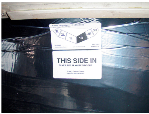
Boeing 757 Cockpit HeatShield set, installation detail