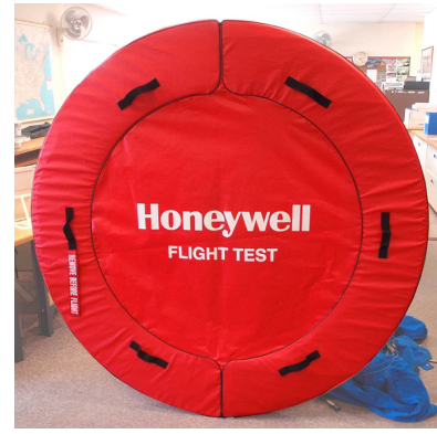
Boeing 757 Engine Intake Plugs, folding type