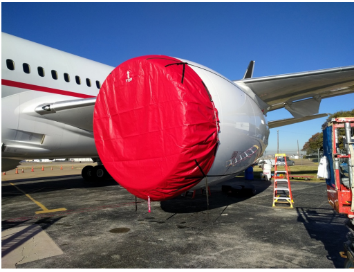
Boeing 787 Intake Cover