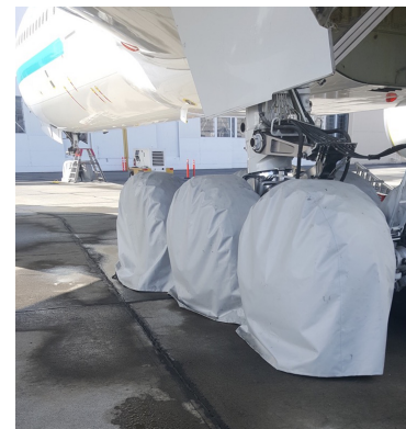
Boeing 777 Main & Nose Gear Tire Covers