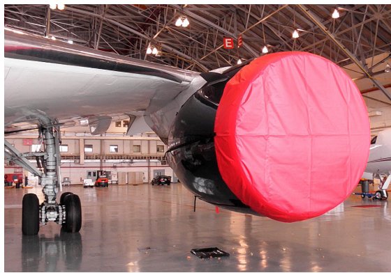
Boeing 767 Intake Covers, P/N: B767-105