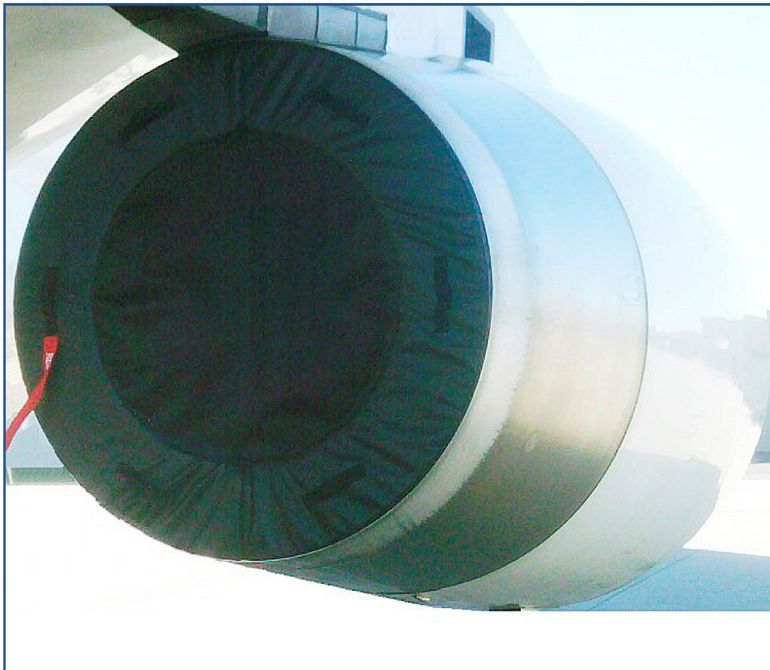
Boeing 757 Exhaust Plugs, RB.211 Engine (Comes in colors)