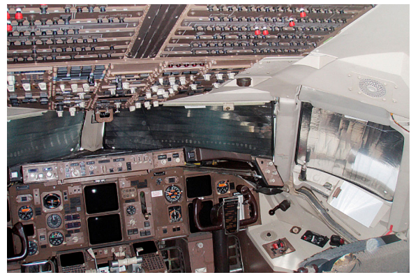
Boeing 757 Cockpit HeatShield set