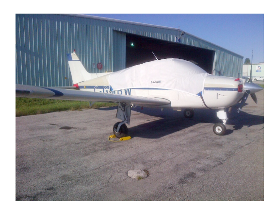
Beech Sierra Canopy Cover, Engine Plugs, Tailcone Cover

plugs are imprinted with the aircraft registration number in black for an extra charge. Storage bag NOT included. Engine plugs may be inserted after flight when the engine is still warm. Engine Inlet Plugs are commonly referred to as Cowl Plugs, Intake Plugs, Cowl Blocks, Engine Blocks, and Engine Bungs.