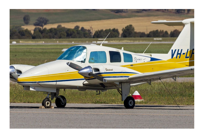
Beech Duchess B76 Heatshield Set