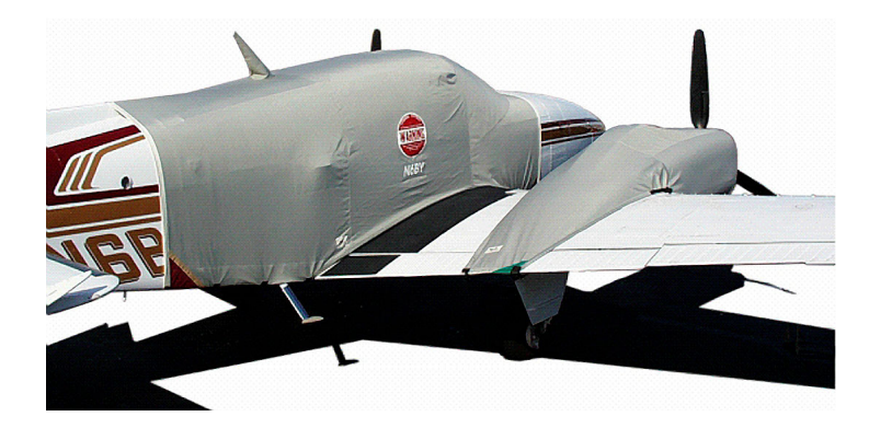
Baron Extended Canopy Cover & Engine Covers