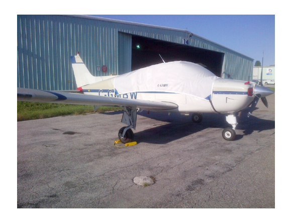
Beech Sierra Canopy Cover, Engine Plugs, Tailcone Cover