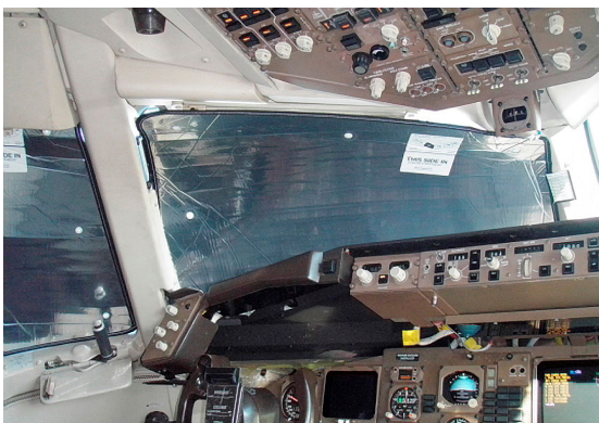
Boeing 767 Cockpit HeatShield set

Cockpit Heatshields are interior sunshades for the aircraft's cockpit. The product is a unique composite of closed-cell foam with a silver mylar finish. The semi-rigid design is stiff enough to stand inside the window framing. The set folds up flat and is easily stored in the included storage sleeve. Some designs may require velcro and suction cups. Our Heatshields for jets are offered white side out because some aircraft manufacturers have issued advisories against reflective window inserts due to potential heat damage. A Heatshield is an excellent short-term remedy for cockpit overheating, but an external fabric cover is more effective for long-term protection.