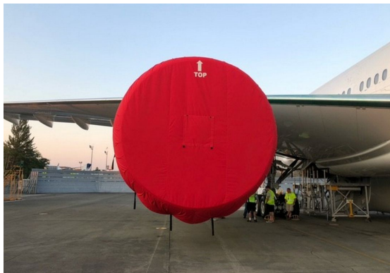
Boeing 777 Intake Covers, GE9X Engine