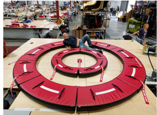
Boeing 777 Exhaust Plug Set