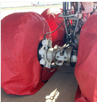
Boeing 777 Main Gear Tire Covers

ALL-YEAR USE MATERIAL - Made with Silver Acrylic Sunbrella canvas, the all-year use material is the best option for sun protection and cover longevity. This heavier more durable material is intended for all weather conditions, such as rain and snow or lots of sun.