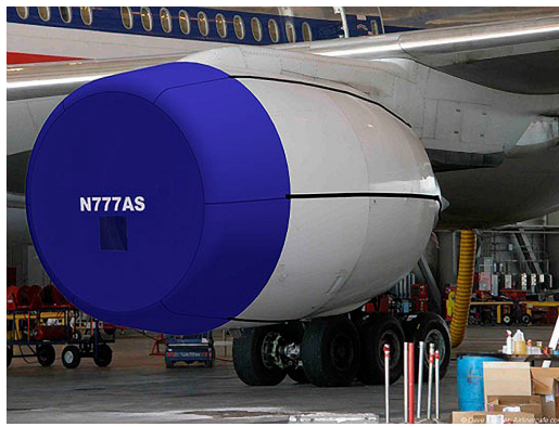
Boeing 777 Intake Cover, GE Engine