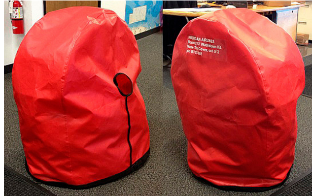
Boeing 757 Tire Covers, great for Wash Prep or Storage