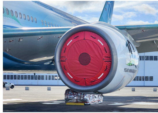
Boeing 777 Intake Plugs, framed, Bi-fold design.