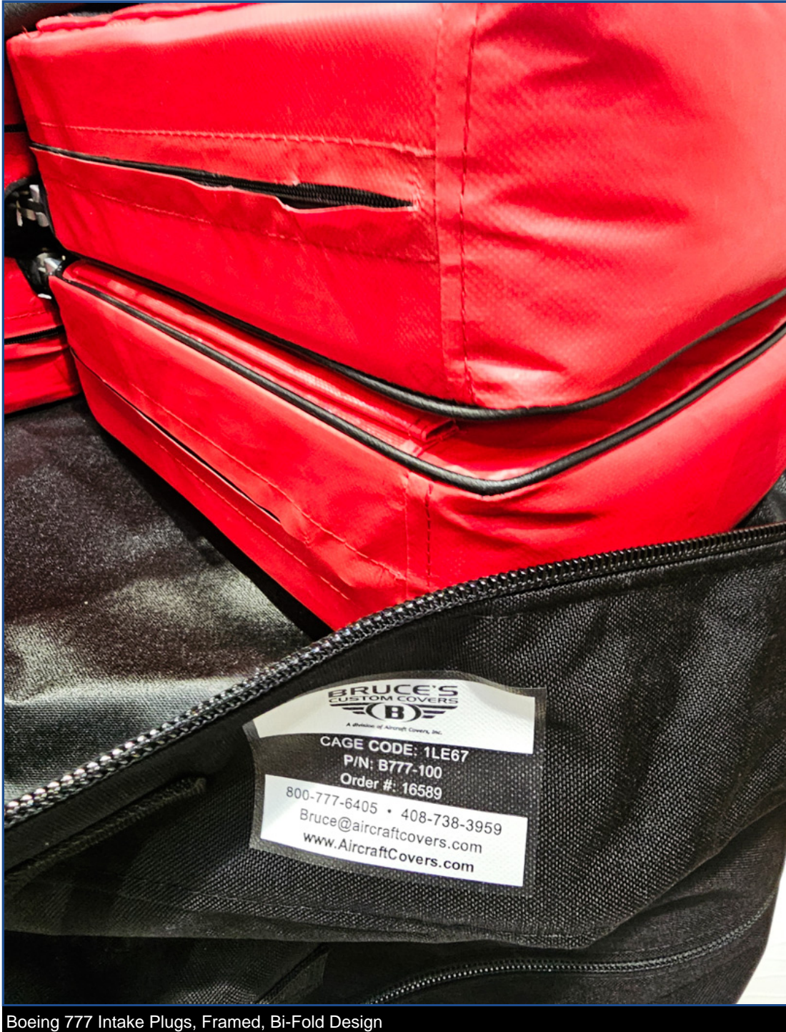
Boeing 777 Intake Plugs, Framed, Bi-Fold Design