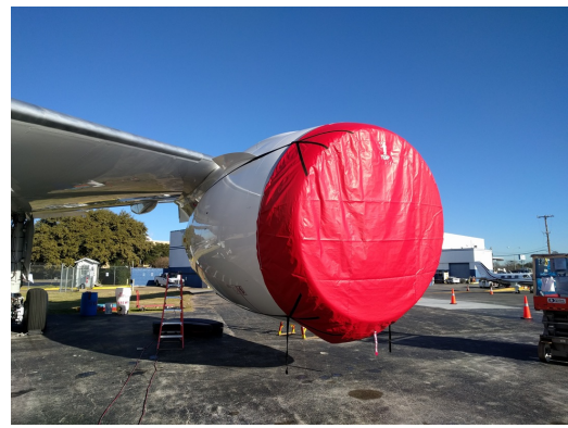
Boeing 787 Intake Cover