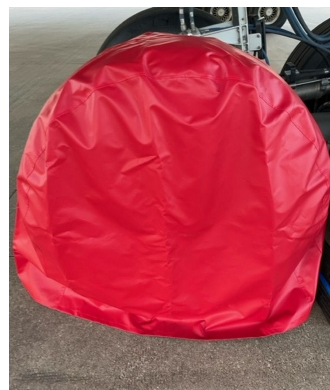
Boeing 777 Main Gear Tire Covers