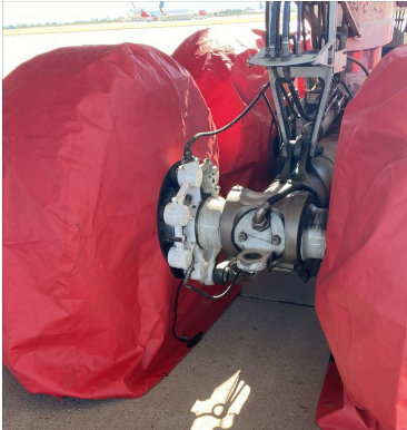
Boeing 777 Main Gear Tire Covers

ALL-YEAR USE MATERIAL - Made with Silver Acrylic Sunbrella canvas, the all-year use material is the best option for sun protection and cover longevity. This heavier more durable material is intended for all weather conditions, such as rain and snow or lots of sun.