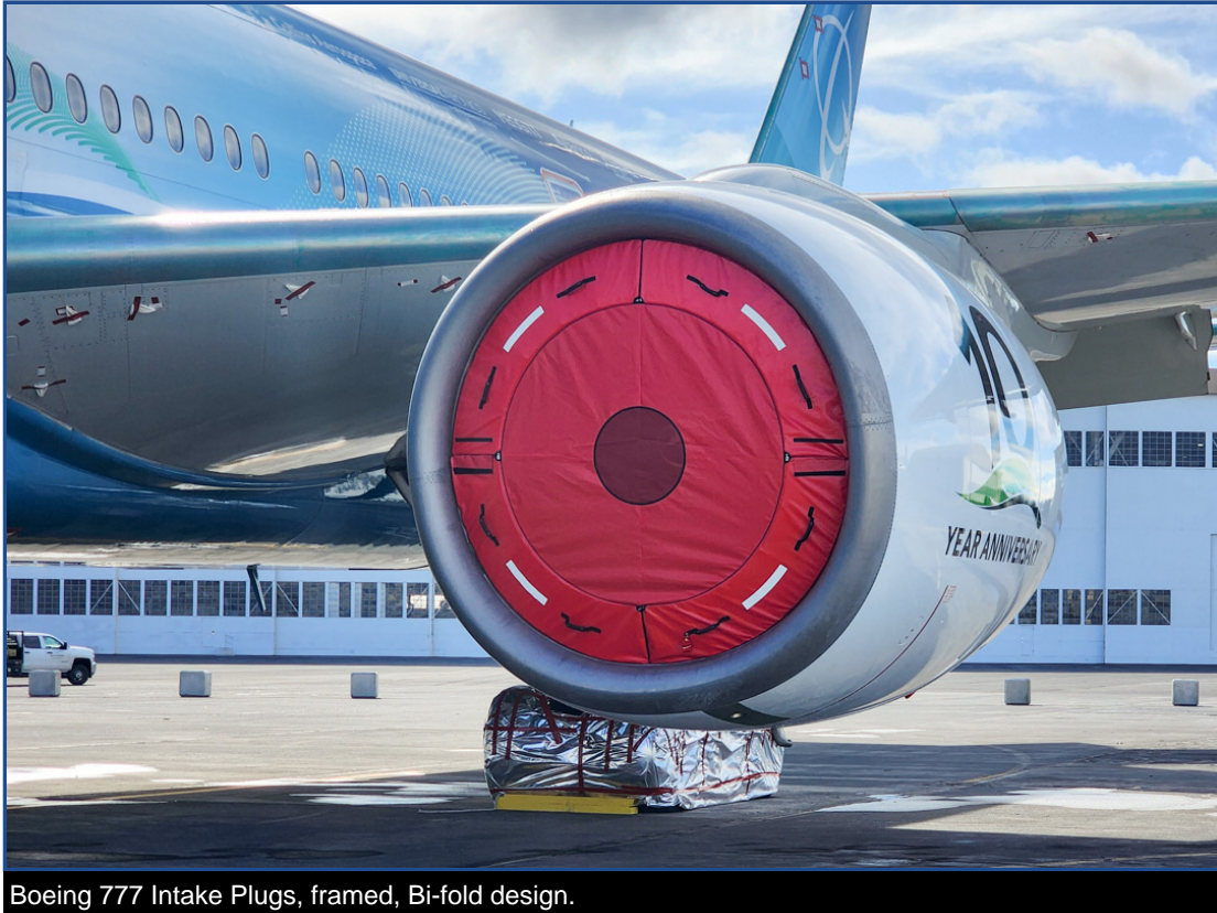
Boeing 777 Intake Plugs, framed, Bi-fold design.