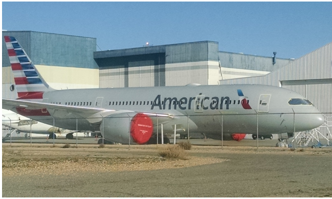
Boeing 787 Intake Covers