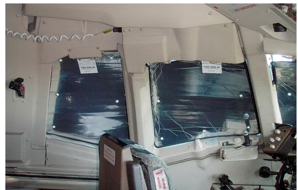
Boeing 767 Cockpit HeatShield set