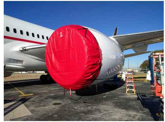
Boeing 787 Intake Cover